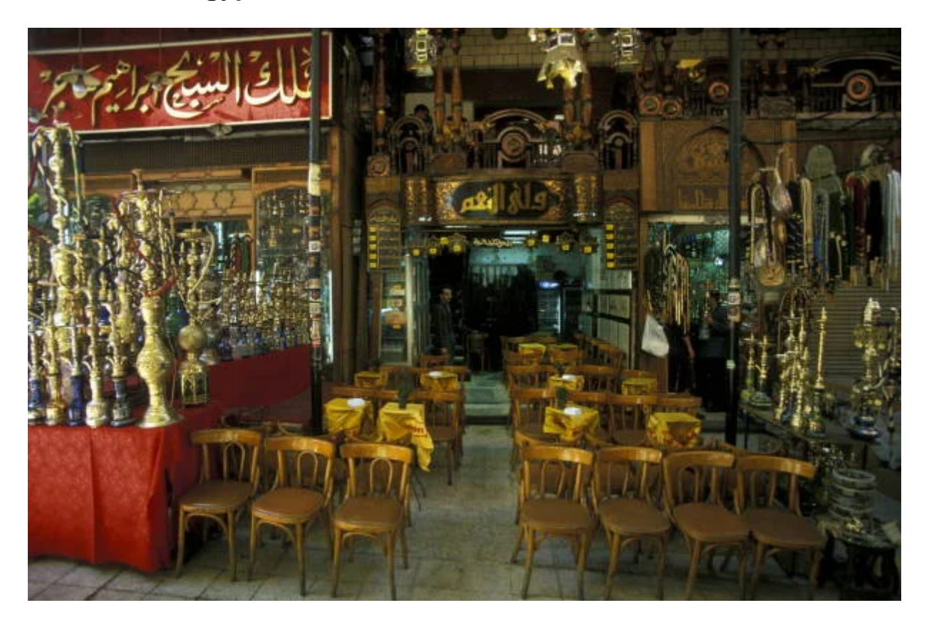
Día 6: Fly beck to Cairo , National Egyptian Civilization , Khan El Khalili