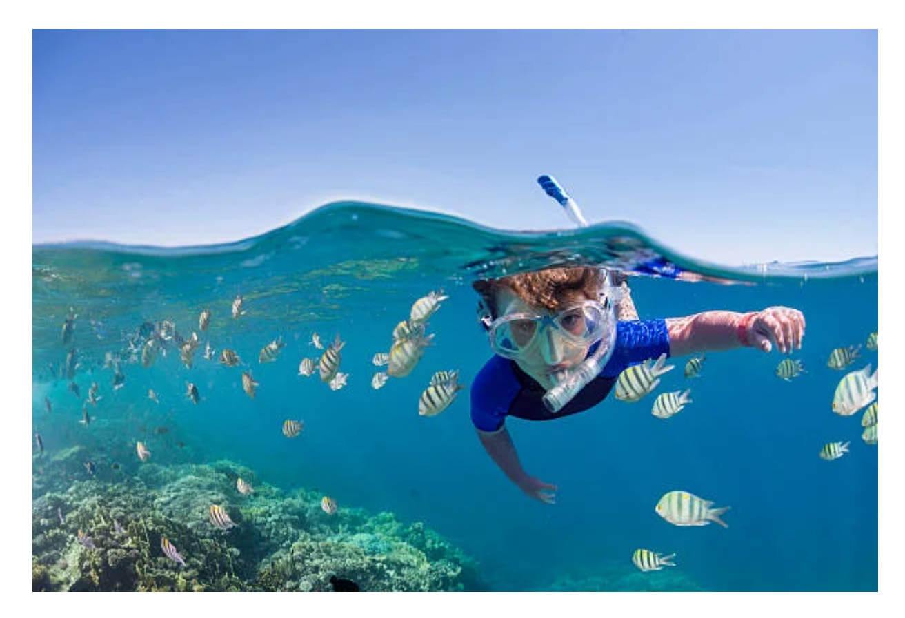
Día 2: Fly to Marsa Alam