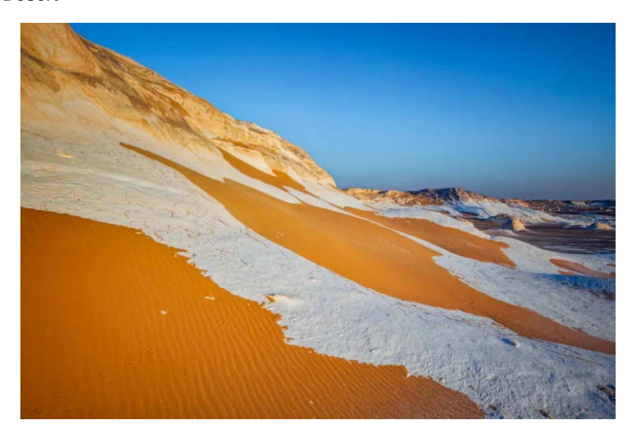
Día 1: Cairo- White Desert

You will go on a four-hour trip into the white desert on After about 350 km, you will stop to have lunch and some refreshments, also known as the jewel of the desert, because it is a hill of crystal-like crystals where you can watch suitable exhilarating when the light hits it, then it will be used in horses in the desert and dinner in the camp, but enjoy watching the stars, and the next day you can enjoy a full day.