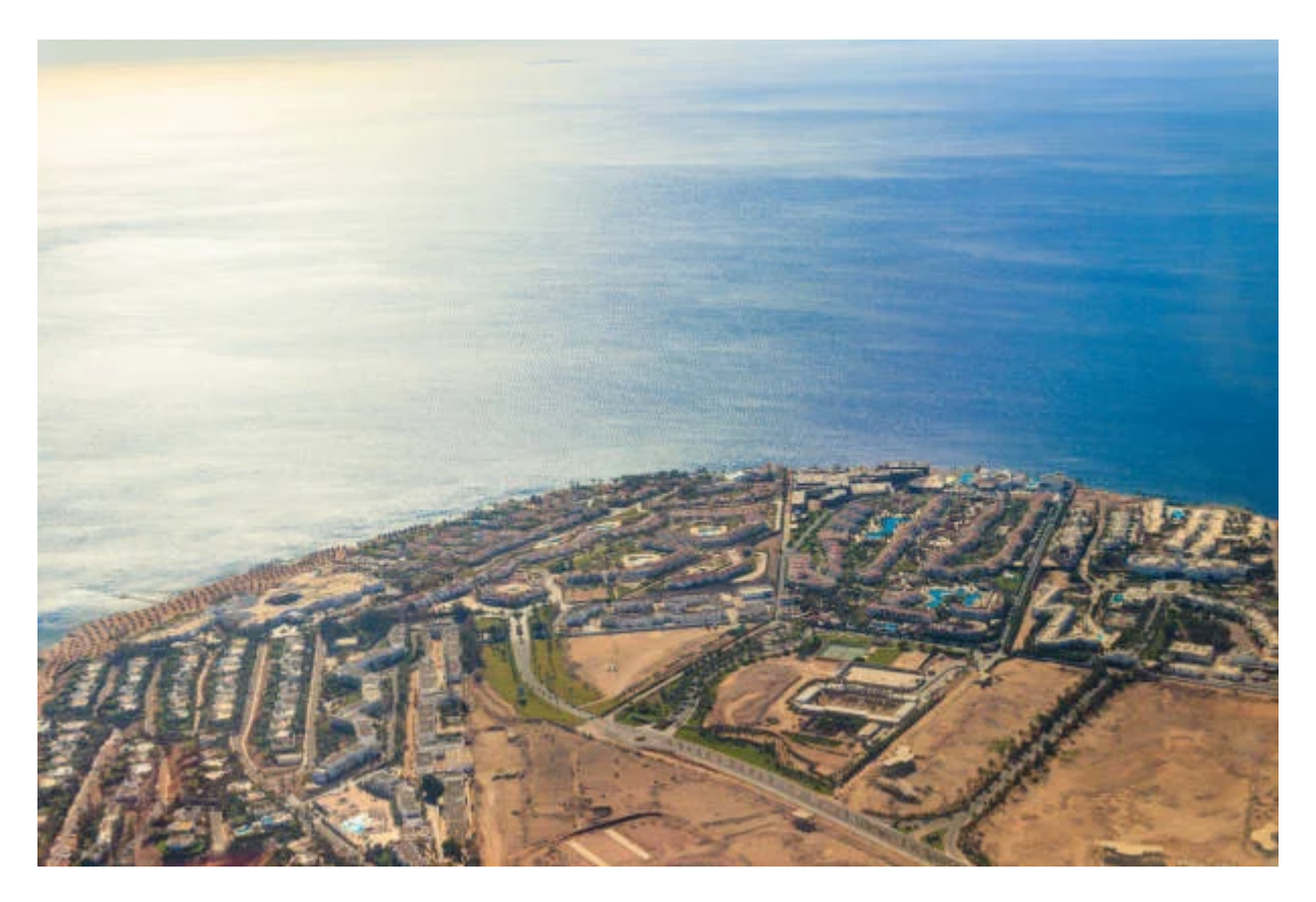
Día 2: Fly to Sharm El-Sheik