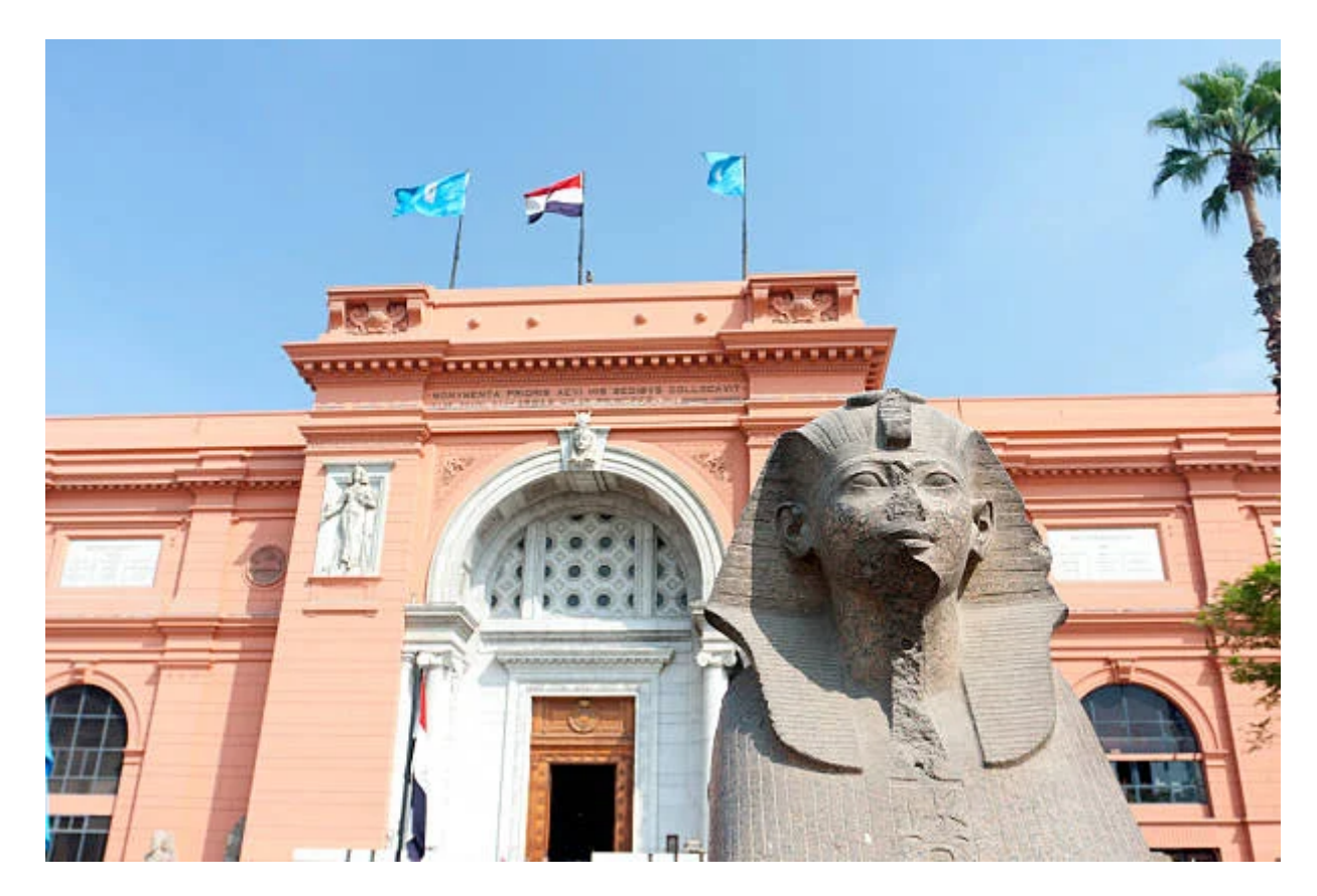
Día 4: Egyptian Museum, National Museum of Civilization, Old Cairo