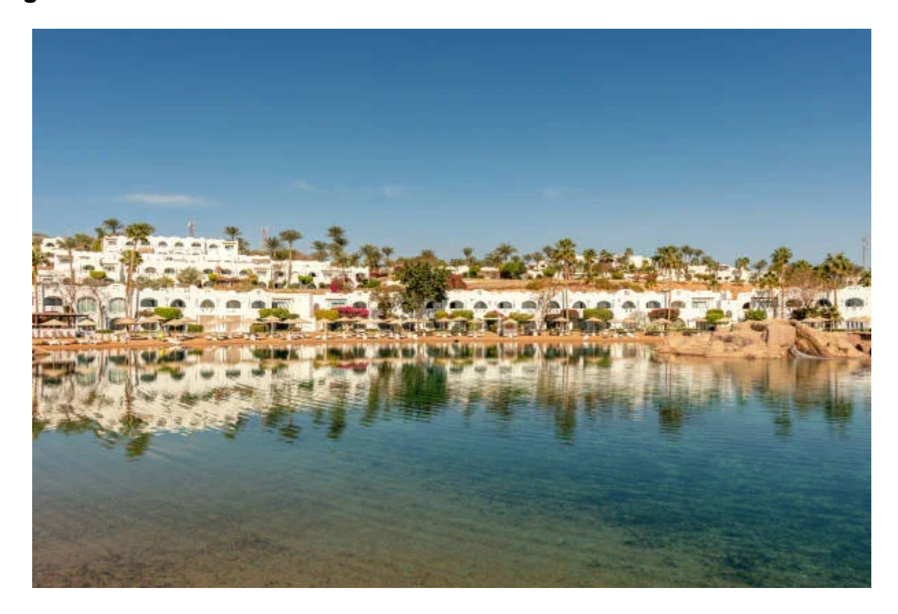
Día 2: Free Day, Hurghada

Once you arrive at Cairo Airport, our representative will receive and welcome you, and then you will travel to Hurghada . When you arrive at the airport, our representative will be waiting for you. He will take you in an air-conditioned car to go to your hotel to relax.