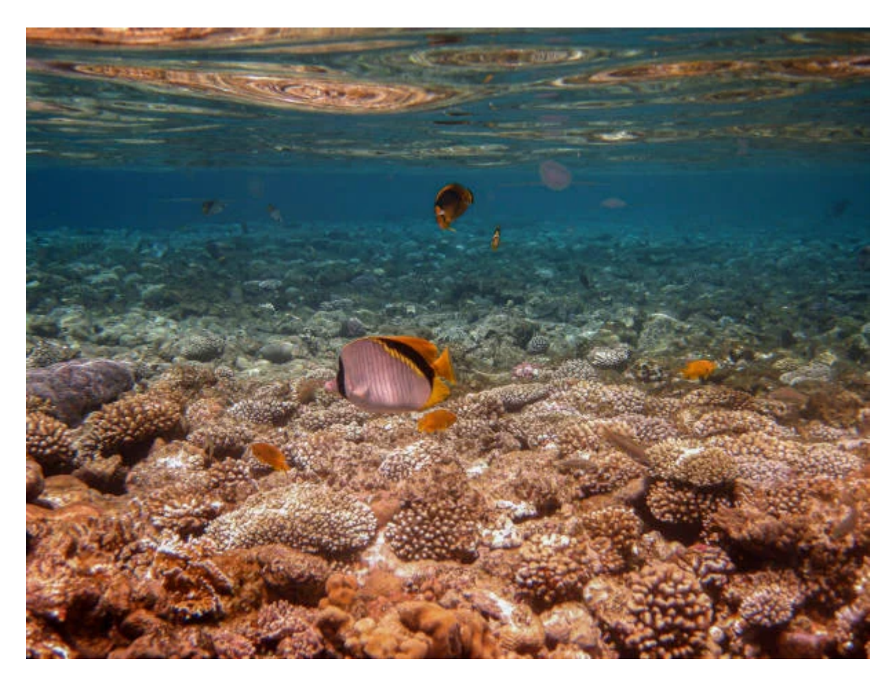
Día 1: Arrival

Once you arrive at Cairo Airport, our representative will receive and welcome you, and then you will travel to Hurghada . When you arrive at the airport, our representative will be waiting for you. He will take you in an air-conditioned car to go to your hotel to relax.