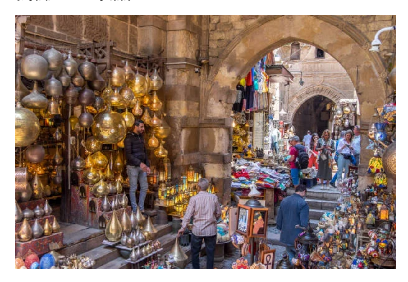
Día 8: khan El-Khalili & Salah El Din Citadel