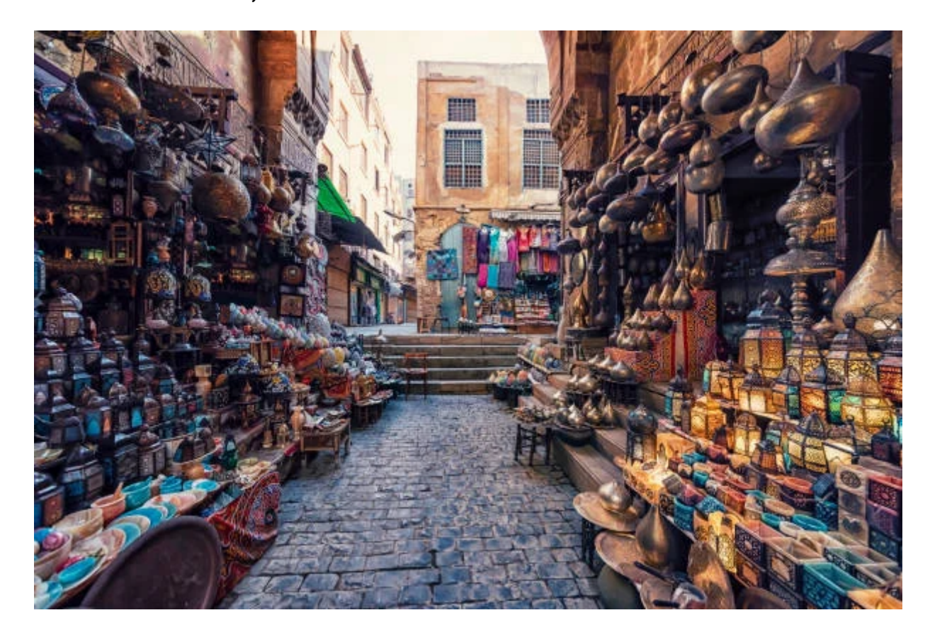
Día 7: National Museum of Civilization, Khan EL Khalili

Our representatives will take you on an interesting free time tour of Cairo and visit the archaeological sites of Paris, where the Egyptian Museum includes a large collection of statues and antiquities.. We will also take you on a tour of the Pyramids , Memphis , Saqqara and the continent which you can enjoy on a tour of Coptic and Islamic antiquities,