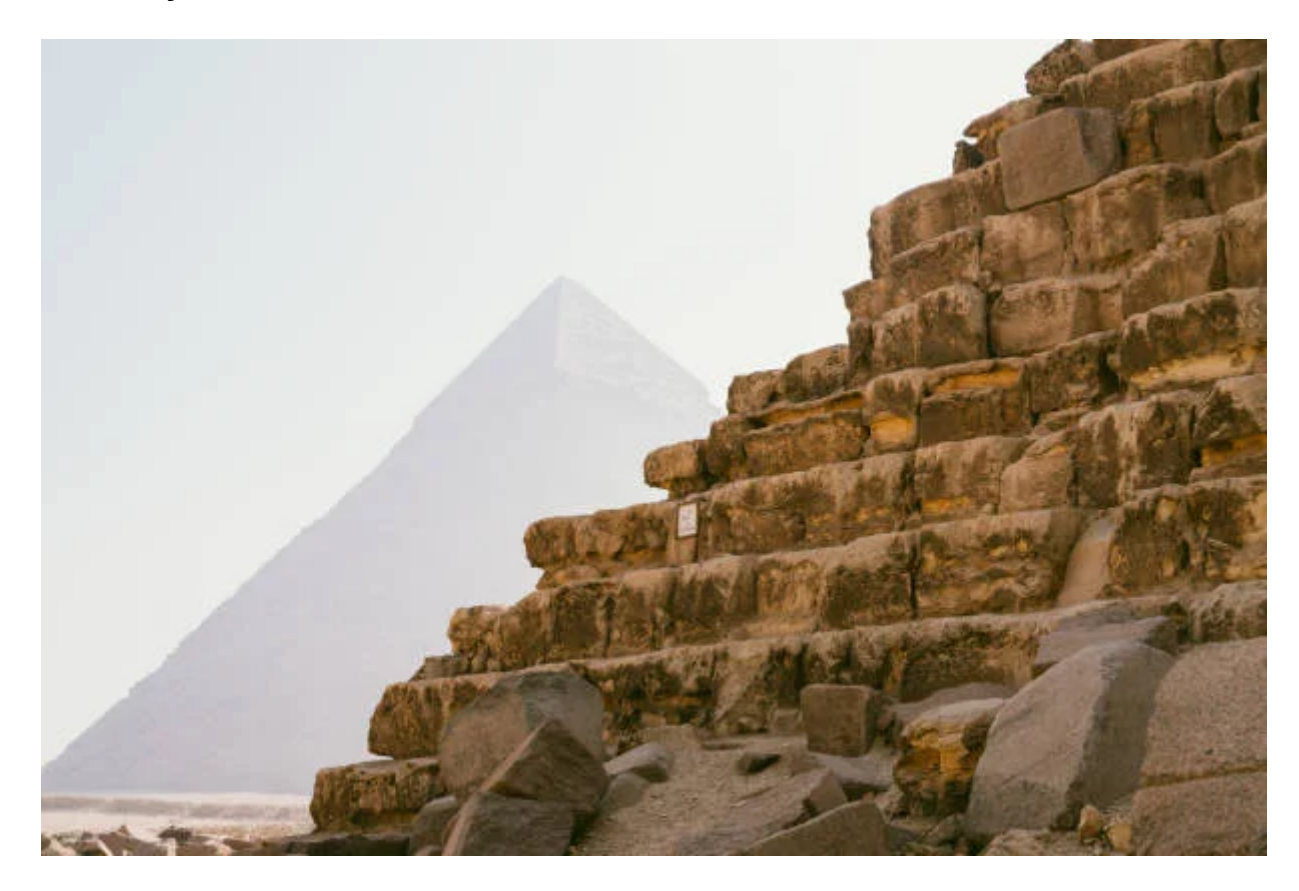
Día 2: Memphis , Sakkara , Pyramids tour

Our representatives will take you on an interesting free time tour of Cairo and visit the archaeological sites of Paris, where the Egyptian Museum includes a large collection of statues and antiquities.. We will also take you on a tour of the Pyramids , Memphis , Saqqara and the continent which you can enjoy on a tour of Coptic and Islamic antiquities,