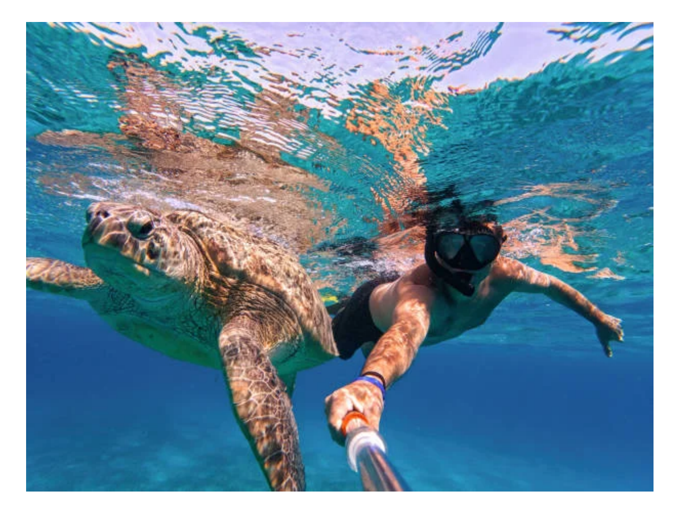
Día 6: Marsa Alam

Our representatives will take you on an interesting free time tour of Cairo and visit the archaeological sites of Paris, where the Egyptian Museum includes a large collection of statues and antiquities.. We will also take you on a tour of the Pyramids , Memphis , Saqqara and the continent which you can enjoy on a tour of Coptic and Islamic antiquities,