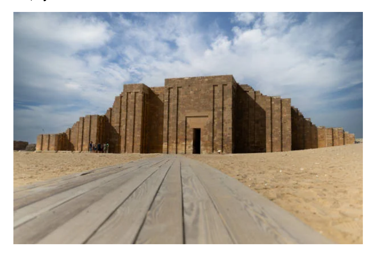
Día 2: Memphis, Sakkara, Pyramids Tour