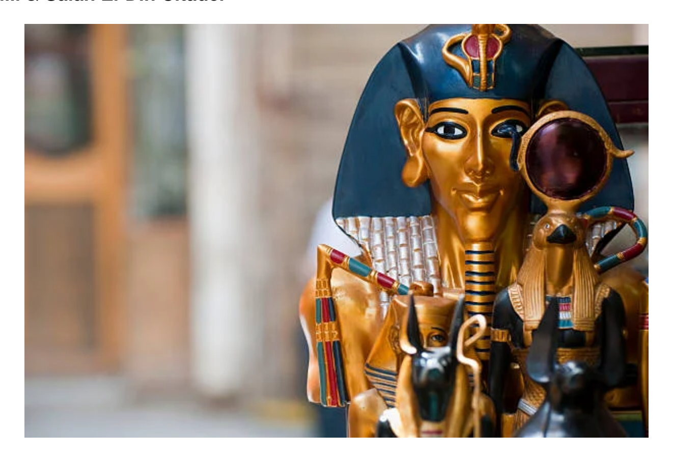
Día 5: Khan el-Khalili & Salah El-Din Citadel