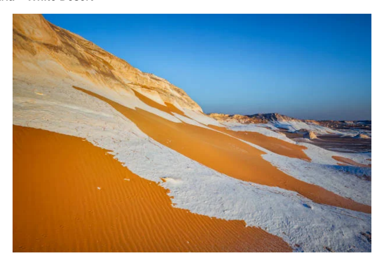
Día 4: Cairo – Baharia – White Desert

The next day, you will go to the area of the pyramids of Giza and see the pyramids, the three, and the Sphinx , and then visit the pyramids of Saqqara , some after, and then we will take you to our representative for lunch, then return to your hotel to relax. The morning of the next day, after eating breakfast, we will take you to our delegates to visit the Egyptian Museum and Religions, the Hanging Church , and the Jewish Museum , Coptic, and then take a break to eat lunch on the fourth day of your trip. After breakfast, you will go on a four-hour trip into the white desert on After about 350 km, you will stop to have lunch and some refreshments, also known as the jewel of the desert, because