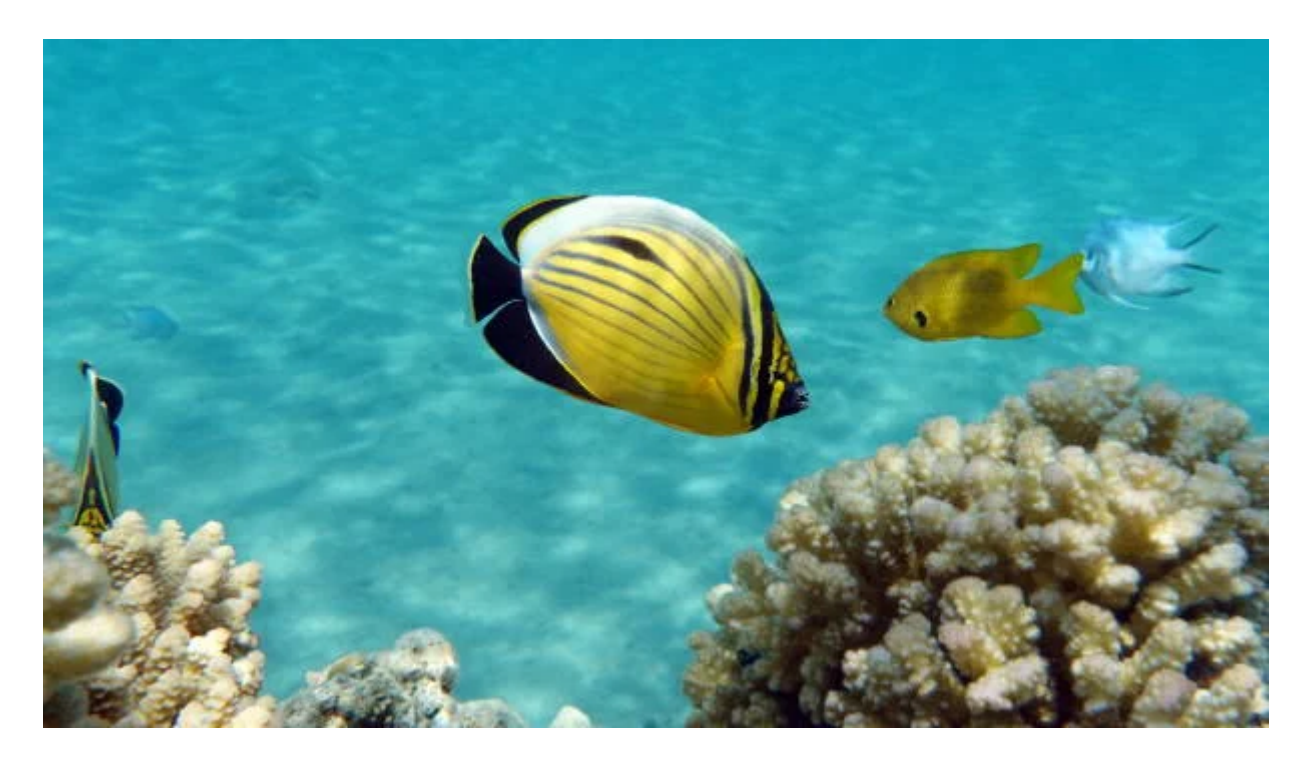
Día 4: Fly to Marsa Alam

then on to Marsa Alam to spend some lovely relaxing time by the Sea Mediterranean.. When the skies are clear, you can enjoy many activities, including water skiing, diving, dolphin watching and more When you return to Cairo,