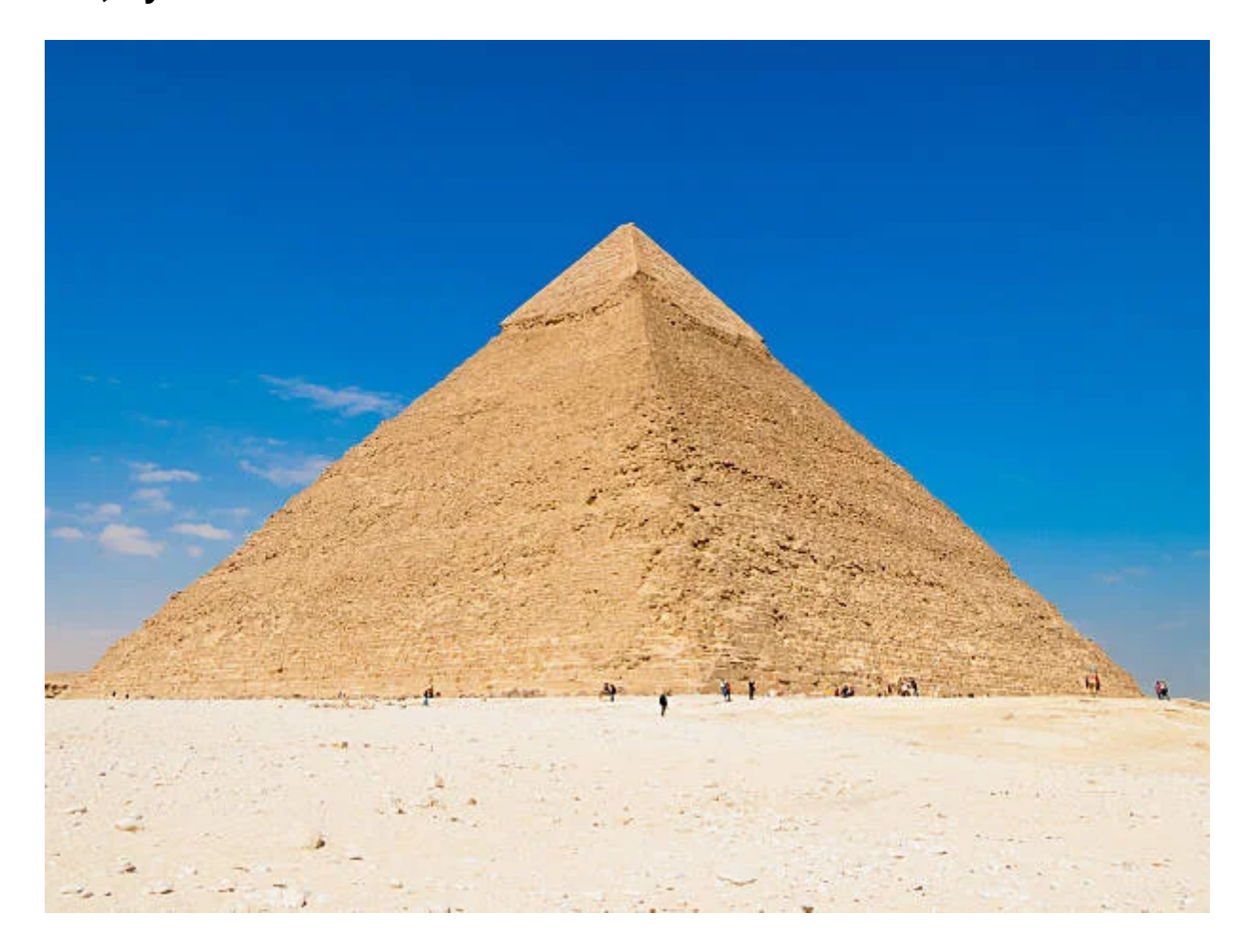
Día 2: Memphis, Sakkara, Pyramids Tour

Our representatives will take you on an interesting free time tour of Cairo and visit the archaeological sites of Paris, where the Egyptian Museum includes a large collection of statues and antiquities.. We will also take you on a tour of the pyramids , Memphis , Saqqara and the continent which you can enjoy on a tour of Coptic and Islamic antiquities,