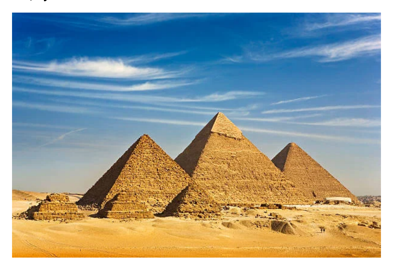
Día 2: Memphis, Sakkara, Pyramids Tour