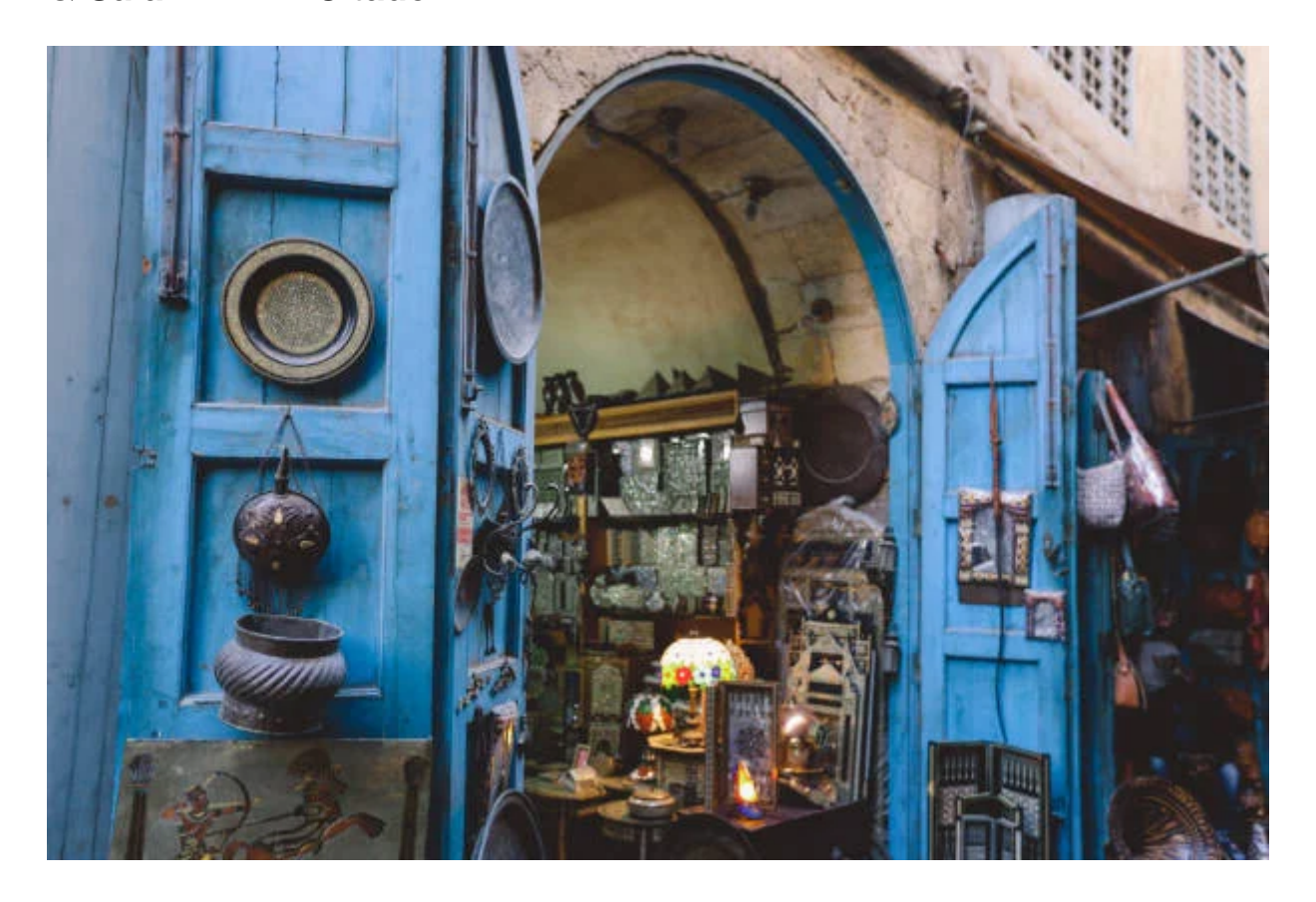
Día 6: Khan el-Khalili & Salah El-Din Citadel

the next day you will go to Alexandria we will take you to the Citadel of Qaitbay and then to Kom el-shukafa and the Pompey's Pillar that was built of granite stone,