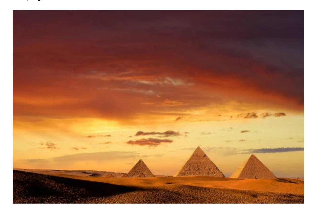
Día 2: Memphis, Sakkara, Pyramids Tour

the next day you will go to Alexandria we will take you to the Citadel of Qaitbay and then to Kom el-shukafa and the Pompey's Pillar that was built of granite stone,