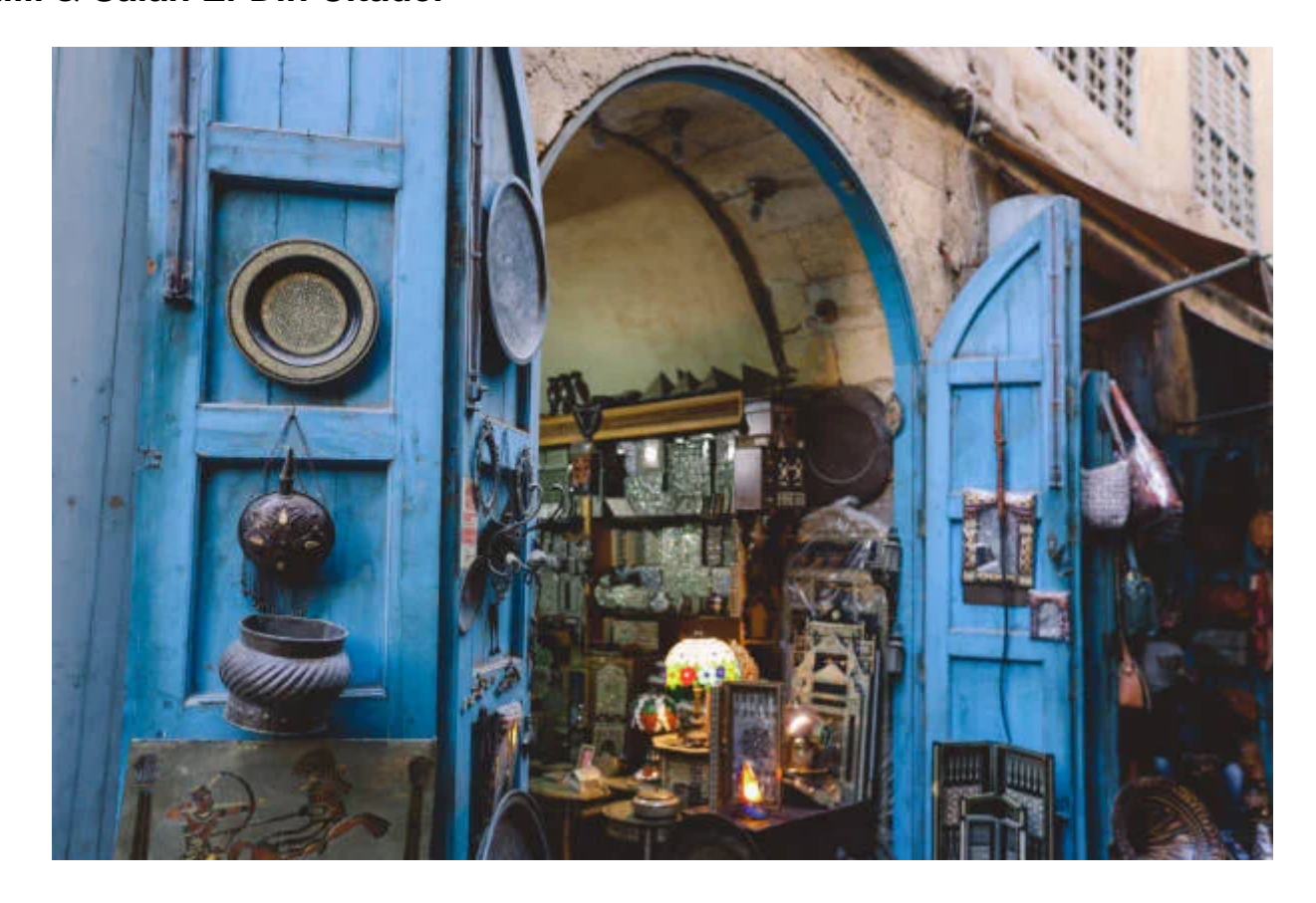
Día 5: Khan el-Khalili & Salah El-Din Citadel

The next morning, you may wake up after a peaceful night at our hotel. You will see Memphis , Saqqara , and the Giza pyramids with an expert tour after breakfast. Once this trip is over, we'll transport you to a nearby restaurant for lunch before dropping you off at your hotel,