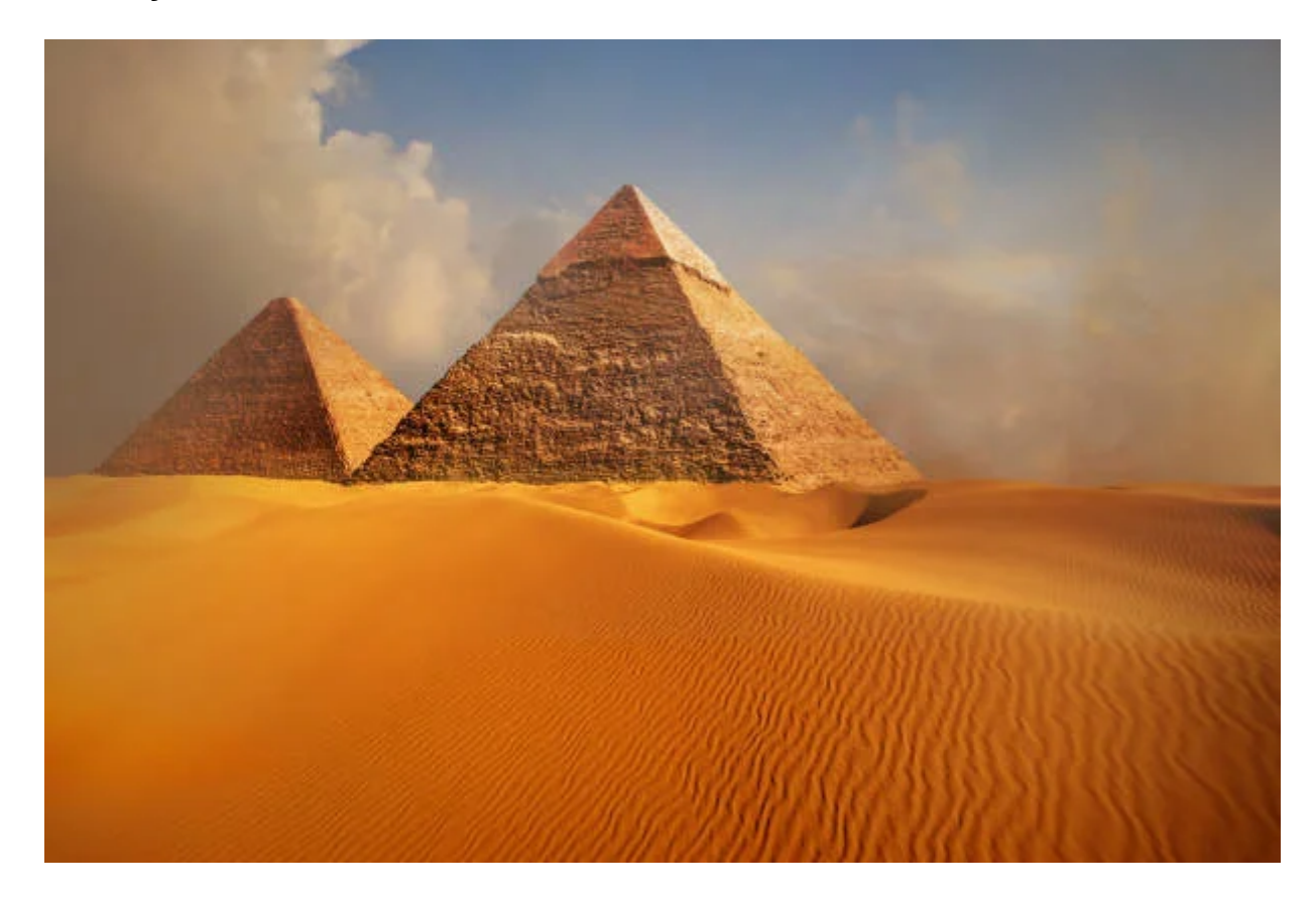
Día 2: Memphis, Sakkara, Pyramids Tour

The next morning, you may wake up after a peaceful night at our hotel. You will see Memphis , Saqqara , and the Giza pyramids with an expert tour after breakfast. Once this trip is over, we'll transport you to a nearby restaurant for lunch before dropping you off at your hotel,