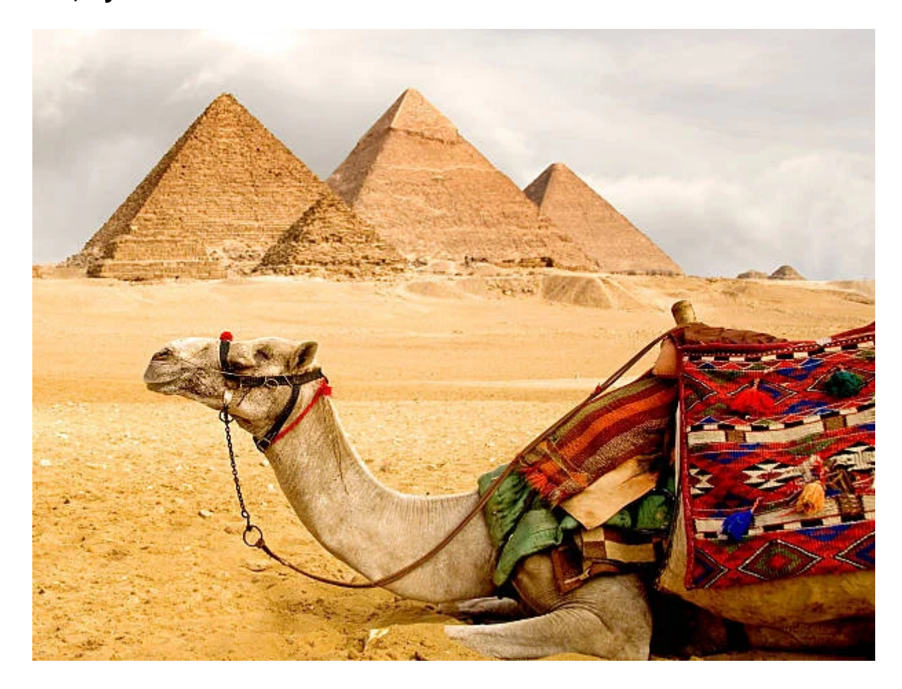
Día 2: Memphis, Sakkara, Pyramids Tour