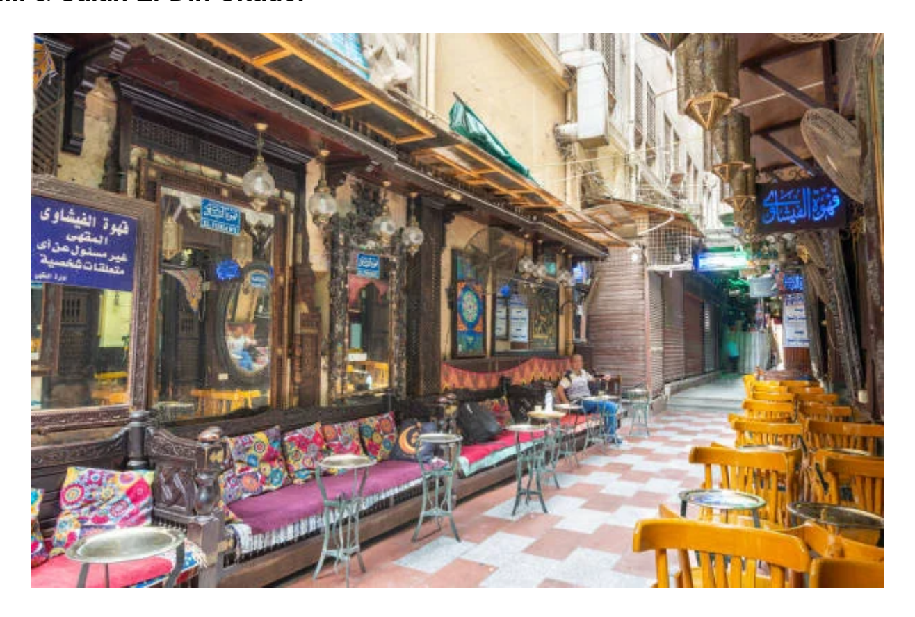
Día 5: Khan el-Khalili & Salah El-Din Citadel

When you get to the airport, we will transport you to our representative in an air-conditioned car so you can rest after a long day of travel to your Cairo hotel. The next morning, you may wake up after a peaceful night at our hotel. You will see Memphis , Saqqara , and the Giza pyramids with an expert tour after breakfast. Once this trip is over, we'll transport you to a nearby restaurant for lunch before dropping you off at your hotel , The next day, we will drive you to Alexandria to see the Qaitbay Citadel , where the Mamluk ruler had taken refuge in the late Mamluk era. In relation to the Pompey's Pillar , which is one of the Alexandrian Cemeteries ; in the evening, head back to the Cairo hotel to get ready for your visit to the Egyptian Museum , which has an extensive collection of antiquated artifacts; after that, head to the National Museum of Civilization , which leads to the church and the Jewish Temple , where you can learn about the nursery. After seeing the Coptic Museum , Coptic Plus goes to the Salah al-Din fortress and Khan Khalili Bazar , where leather, incense, and perfume are