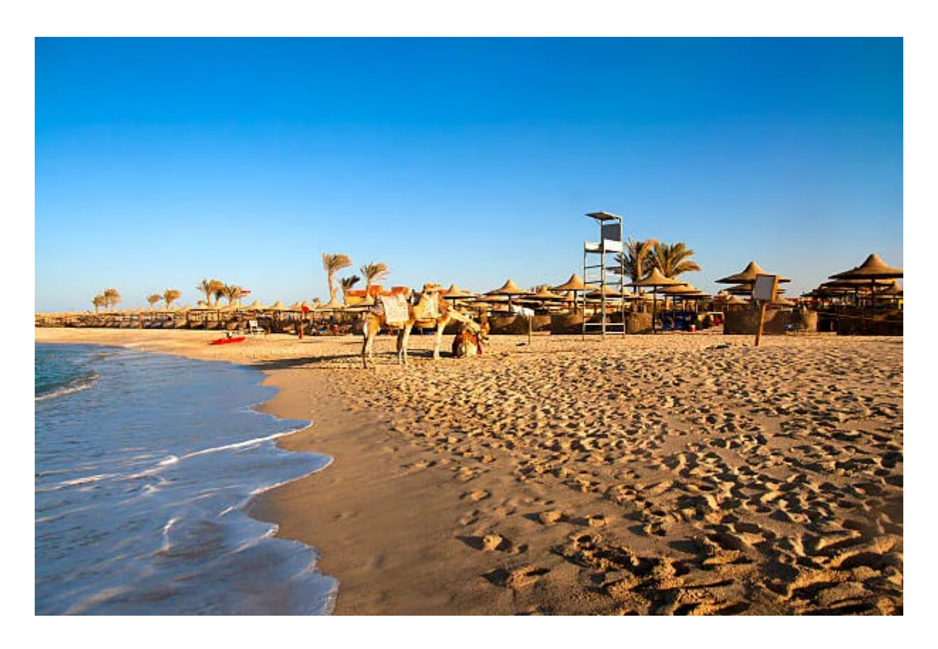
Día 9: Marsa Alam