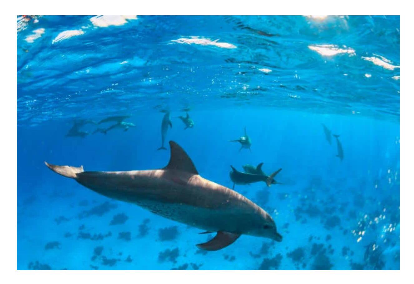
Día 5: Hurghada