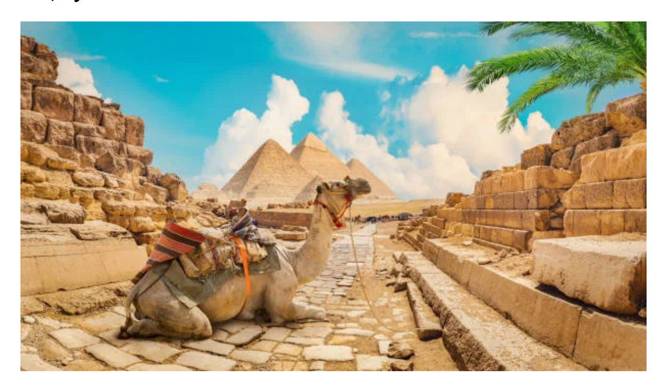
Día 2: Memphis, Sakkara, Pyramids Tour