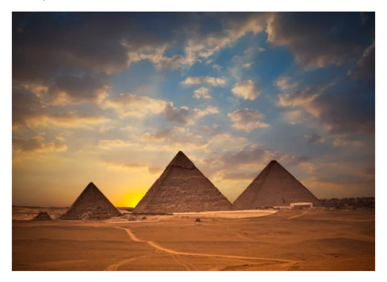
Día 2: Memphis, Sakkara, Pyramids Tour

Upon arrival at the airport, our representative will take you in a private air-conditioned car to your luxury hotel in Cairo, where you can enjoy a comfortable and quiet night at the hotel. The next day, our representative will take you to the Giza Pyramid complex, including the three pyramids, Sphinx , and several mausoleums, followed by a private visit to the Saqqara ruins site, home to several pyramids, including the pyramid of Djoser, the amphitheater, dated dating back to the Third Dynasty of Egypt, which is the oldest known finished stone building in history, and then lunch at a luxurious restaurant. The next day we will go to the Egyptian Museum , which has a large collection of ancient Egyptian antiquities. This place is one of the most beautiful antiquities in Egypt. the largest and most famous museum in the world, and visit