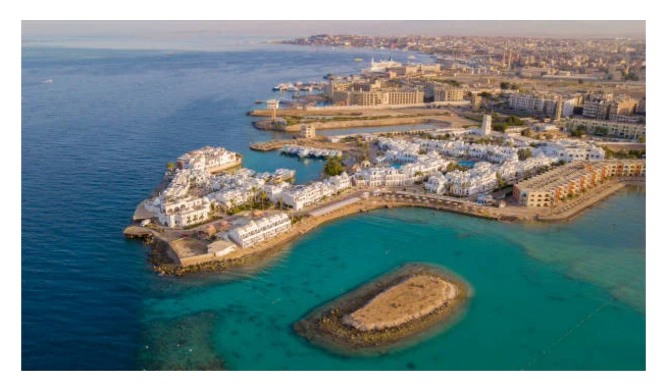
Tag 4: Fly to Hurghada