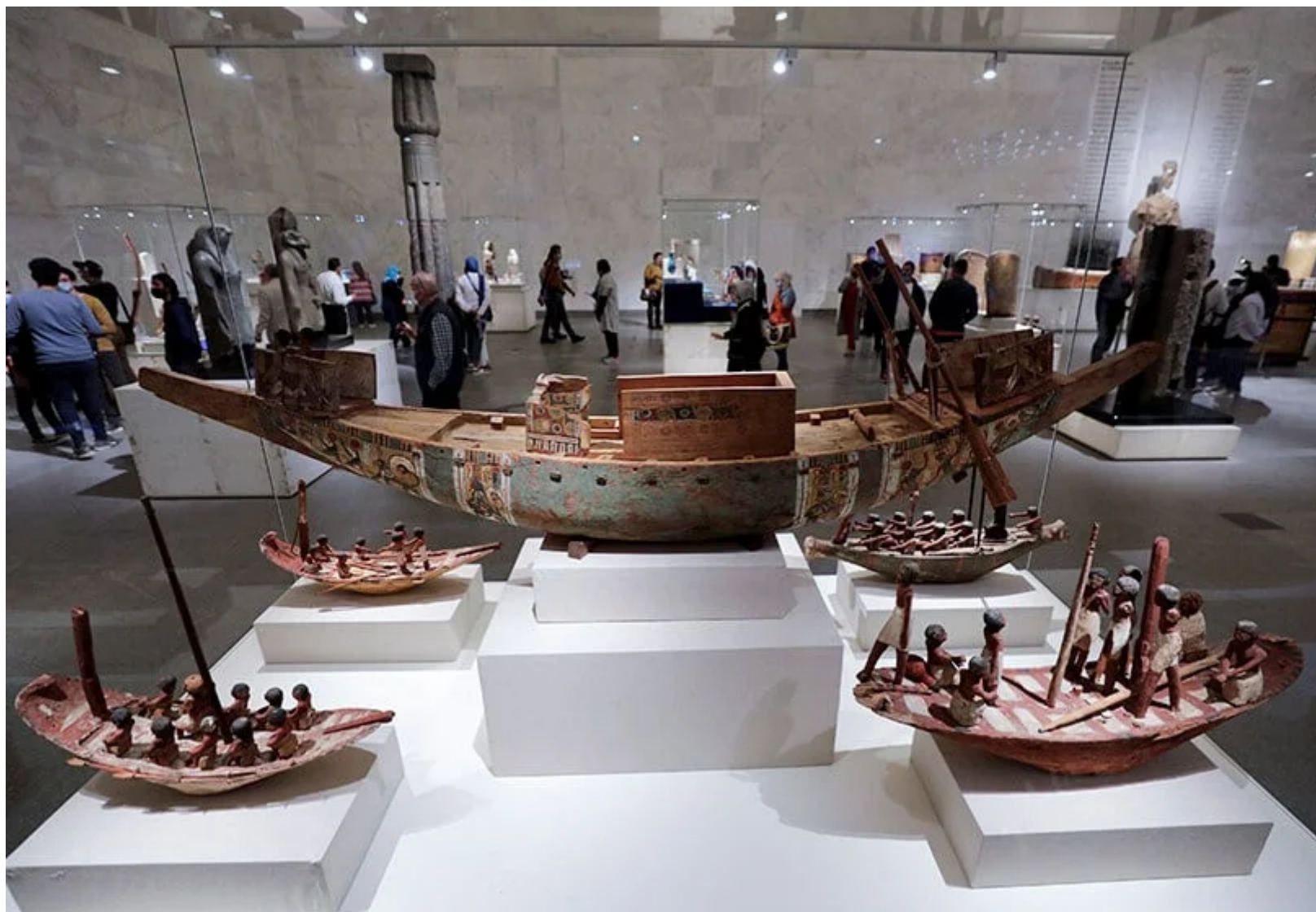
Tag 10: Fly back to Cairo , National Egyptian Museum of Civilization , Khan El Khalili