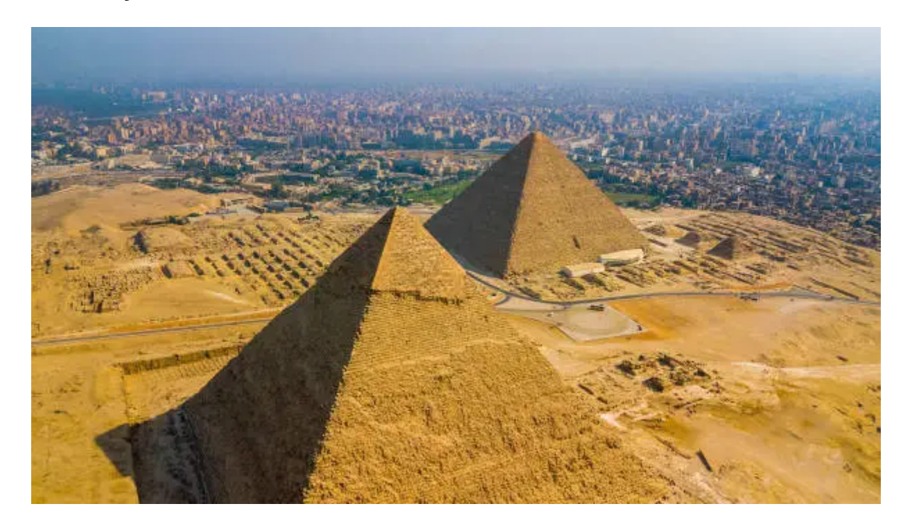
Tag 2: Memphis, Sakkara, Pyramids Tour