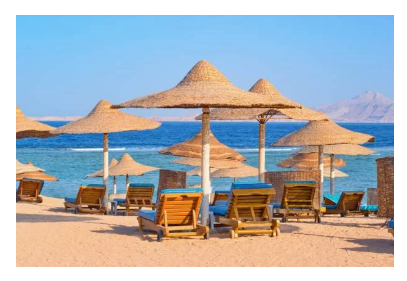
Tag 2: Marsa Alam

Once our representative receives you from the Marsa Alam airport and welcomes you, he will take you to a hotel so that you can have a pleasant time in your hotel and then eat lunch in addition to enjoying a quiet dinner. On the second day, you will go with our representative to practice many different activities and sports and enjoy the tranquility of the beach, clear waters, and rare fish. After that, you will eat dinner, and after spending three days, our representative will take you back to the airport.