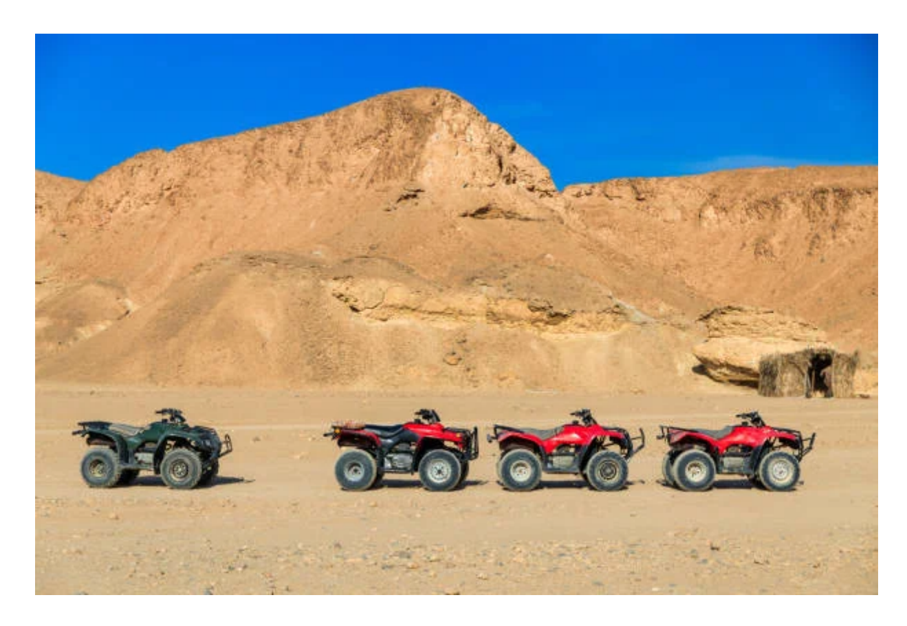
Tag 3: Safari Tour

Once our representative receives you from the Marsa Alam airport and welcomes you, he will take you to a hotel so that you can have a pleasant time in your hotel and then eat lunch in addition to enjoying a quiet dinner. On the second day, you will go with our representative to practice many different activities and sports and enjoy the tranquility of the beach, clear waters, and rare fish. After that, you will eat dinner, and after spending three days, our representative will take you back to the airport.