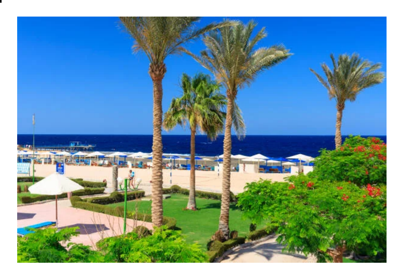
Tag 2: Marsa Alam

Once our representative receives you from the Marsa Alam airport and welcomes you, he will take you to a hotel so that you can have a pleasant time in your hotel and then eat lunch in addition to enjoying a quiet dinner. On the second day, you will go with our representative to practice many different activities and sports and enjoy the tranquility of the beach, clear waters, and rare fish. After that, you will eat dinner, and after spending three days, our representative will take you back to the airport.