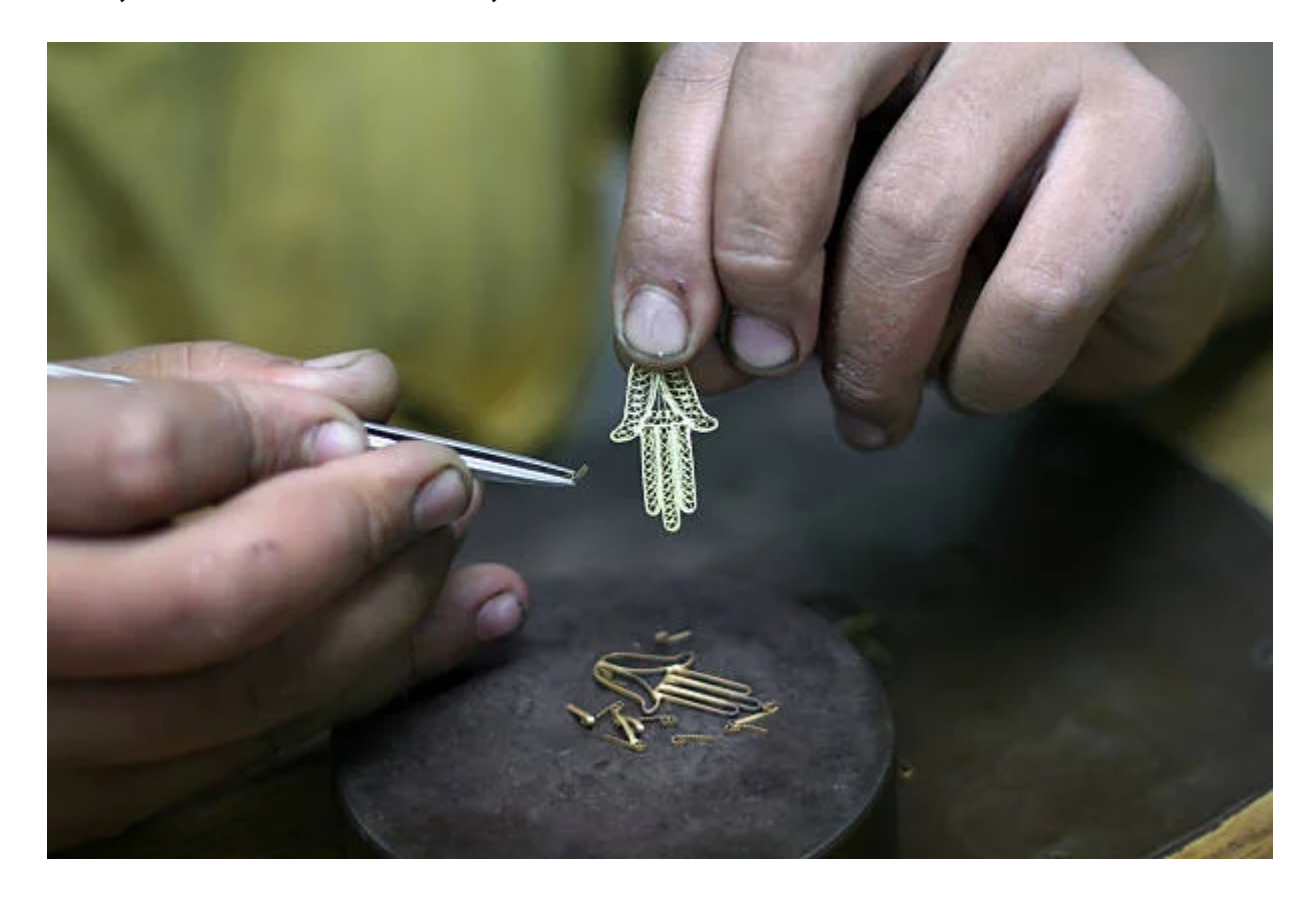
Tag 3: Egyptian Museum ,Salah El Din Citadel , Khan El Khalili

Once you arrive at the airport, our representative will receive and welcome you. Then you will go with him to the Pyramids of Giza , Saqqara , and Memphis . The next day, you will go to the Egyptian Museum , and then you will go to Salah El- Din Citadel and Khan El Khalili Bazar .