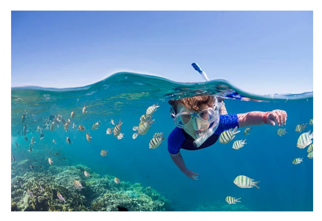
Tag 2: Fly to Marsa Alam