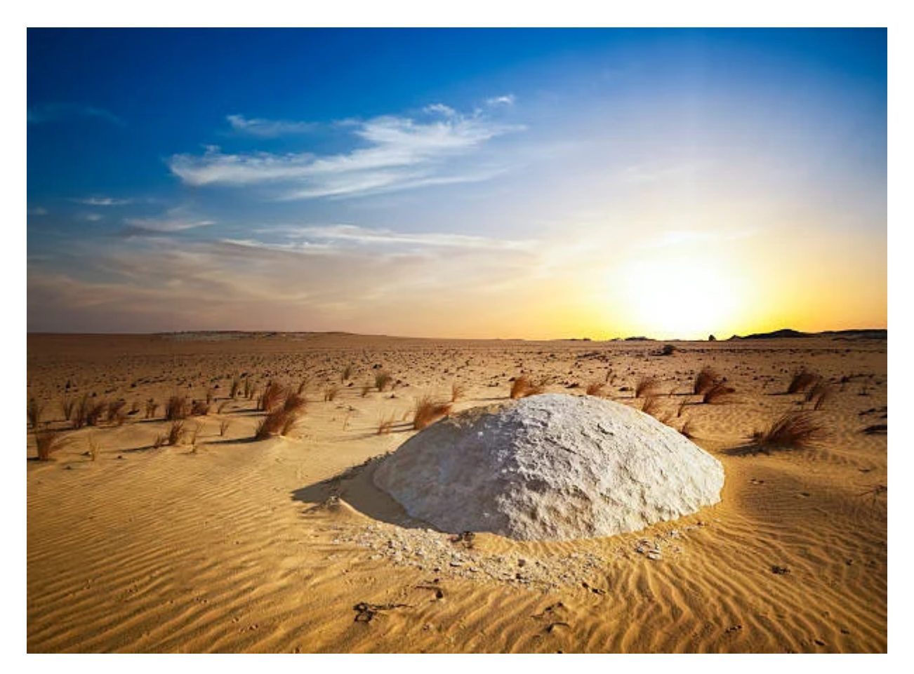
Tag 1: Cairo- White Desert

You will go on a four-hour trip into the white desert on After about 350 km, you will stop to have lunch and some refreshments, also known as the jewel of the desert, because it is a hill of crystal-like crystals where you can watch suitable exhilarating when the light hits it, then it will be used in horses in the desert and dinner in the camp, but enjoy watching the stars, and the next day you can enjoy a full day.