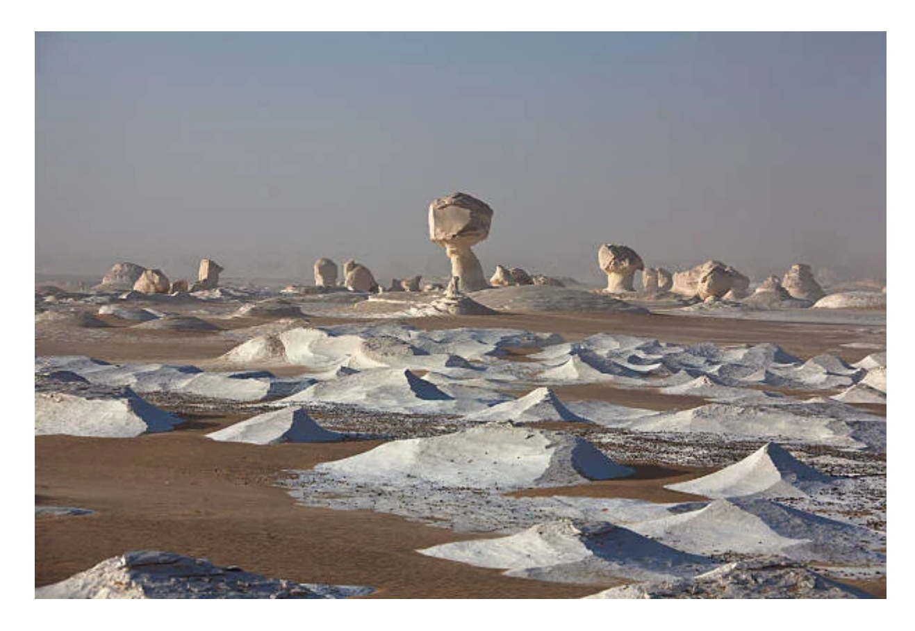
Tag 2: White Desert

You will go on a four-hour trip into the white desert on After about 350 km, you will stop to have lunch and some refreshments, also known as the jewel of the desert, because it is a hill of crystal-like crystals where you can watch suitable exhilarating when the light hits it, then it will be used in horses in the desert and dinner in the camp, but enjoy watching the stars, and the next day you can enjoy a full day.