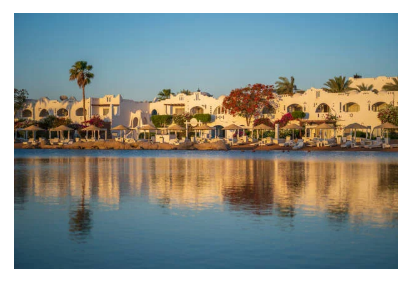
Tag 2: Fly to Sharm El-Sheikh