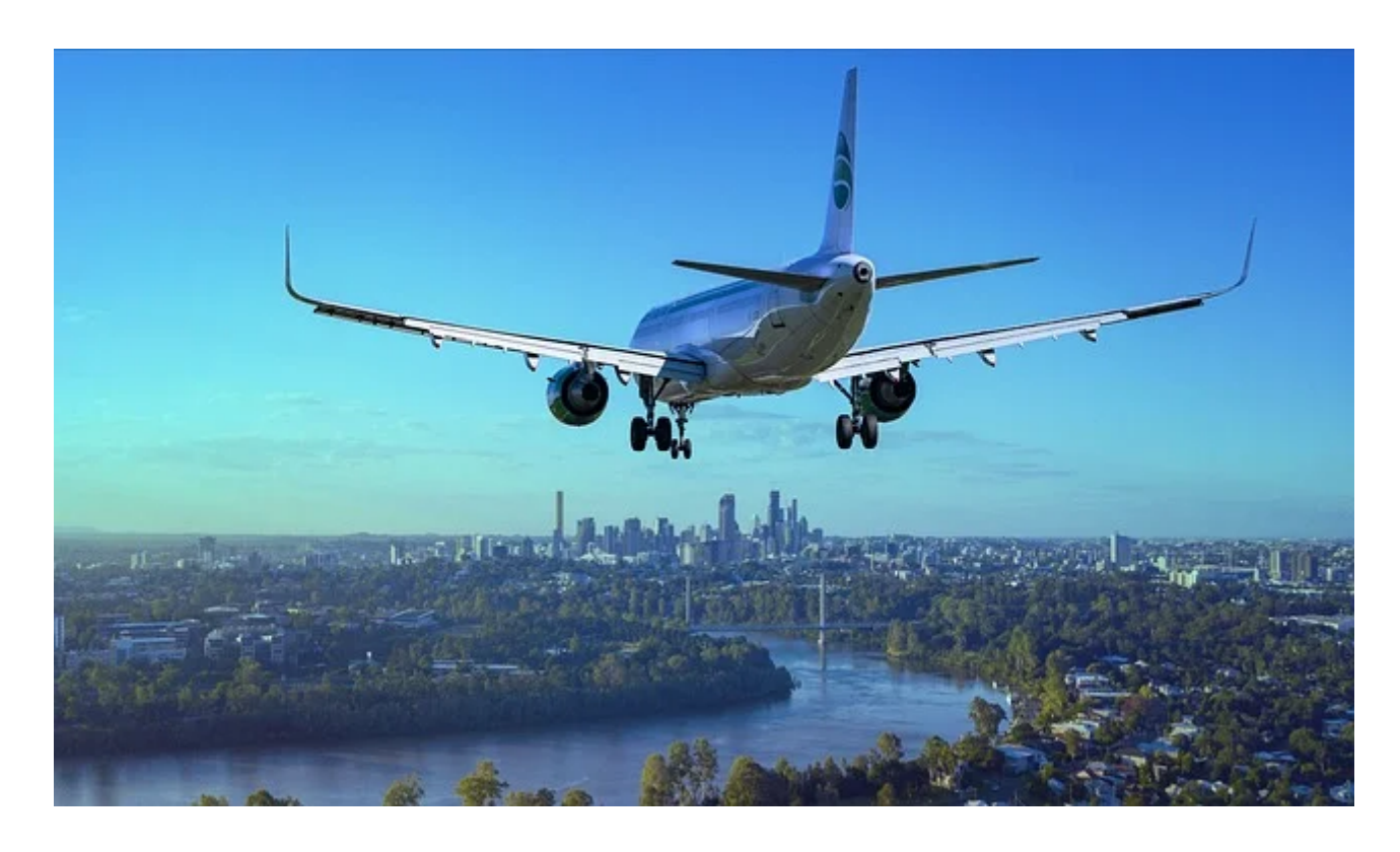
Tag 8: Departure

You will go on a four-hour trip into the white desert on After about 350 km, you will stop to have lunch and some refreshments, also known as the jewel of the desert, because it is a hill of crystal-like crystals where you can watch suitable exhilarating when the light hits it, then it will be used in horses in the desert and dinner in the camp, but enjoy watching the stars, and the next day you can enjoy a full day in health. White will use the location where the White Witch's limestone rocks are. Again, after breakfast on the sixth day, you will go to the National