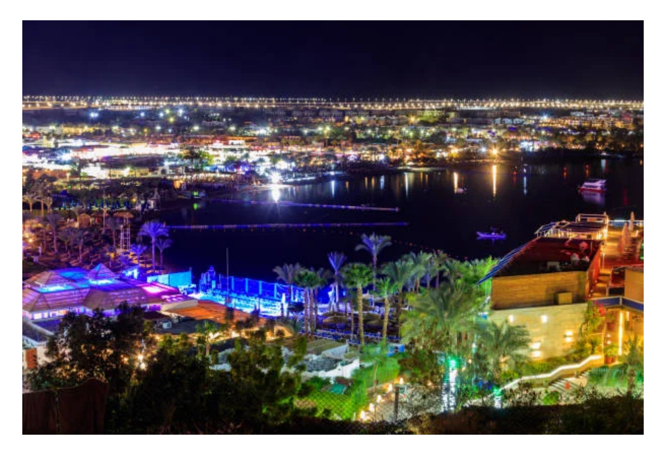
Tag 2: Sharm El-Sheikh

After eating lunch, you can practice many activities, such as diving, watching coral reefs, surfing, and relaxing on the beach. Enjoy the bright sunshine, soft sand, clear blue water, and relaxation. You can also wander the city streets with our representative and buy souvenirs for friends and family. The next day, after eating breakfast at your hotel,