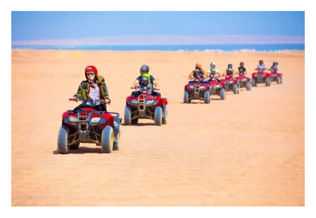
Tag 3: Safari Tour

After eating lunch, you can practice many activities, such as diving, watching coral reefs, surfing, and relaxing on the beach. Enjoy the bright sunshine, soft sand, clear blue water, and relaxation. You can also wander the city streets with our representative and buy souvenirs for friends and family. The next day, after eating breakfast at your hotel,