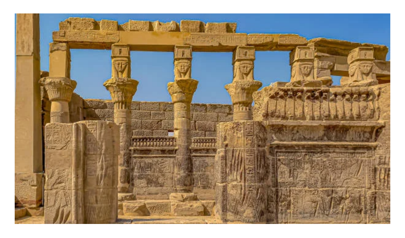
Tag 1: Check in