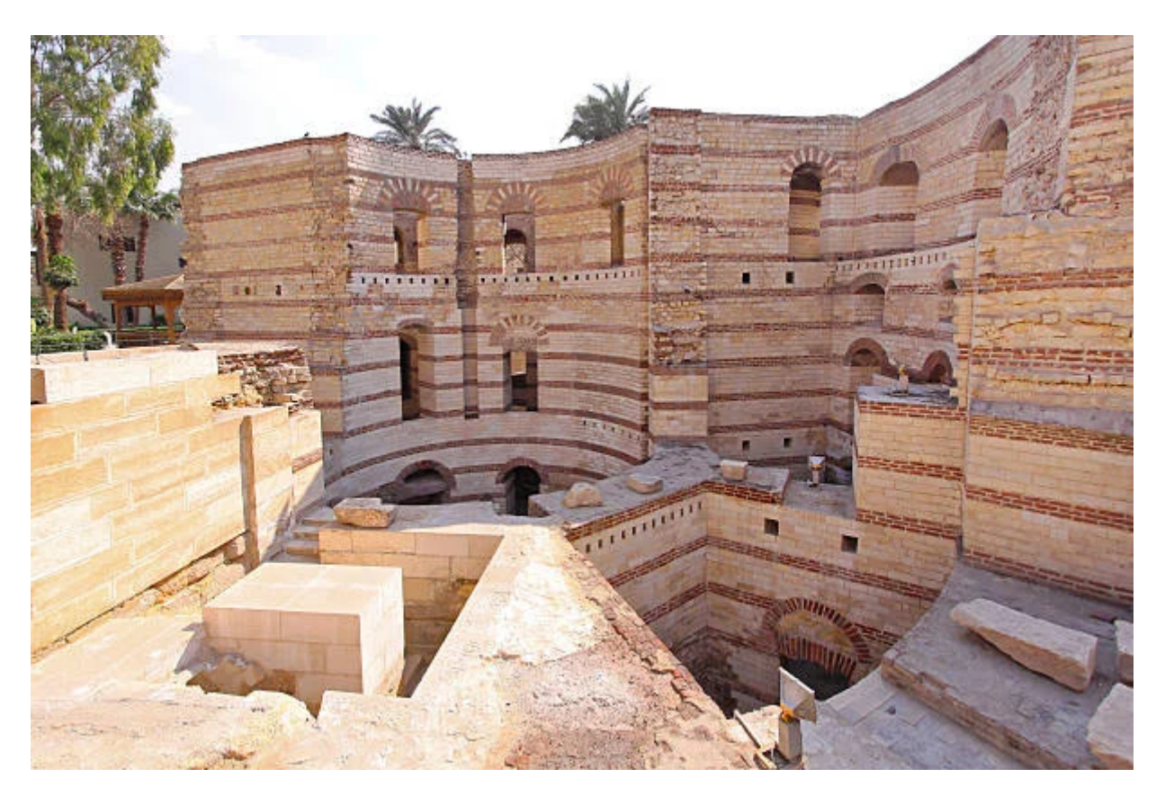
Tag 3: Egyptian Museum, Old Cairo

then on to Marsa Alam to spend some lovely relaxing time by the Sea Mediterranean.. When the skies are clear, you can enjoy many activities, including water skiing, diving, dolphin watching and more When you return to Cairo,