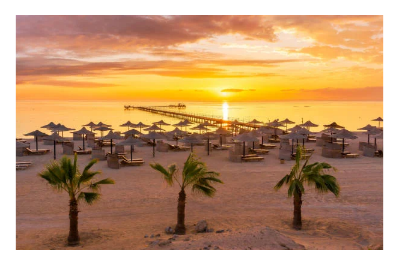
Tag 6: Marsa Alam

then on to Marsa Alam to spend some lovely relaxing time by the Sea Mediterranean.. When the skies are clear, you can enjoy many activities, including water skiing, diving, dolphin watching and more When you return to Cairo,