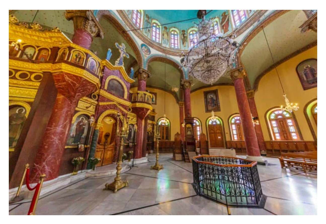
Tag 3: Egyptian Museum, Old Cairo

then on to Marsa Alam to spend some lovely relaxing time by the Sea Mediterranean.. When the skies are clear, you can enjoy many activities, including water skiing, diving, dolphin watching and more When you return to Cairo,