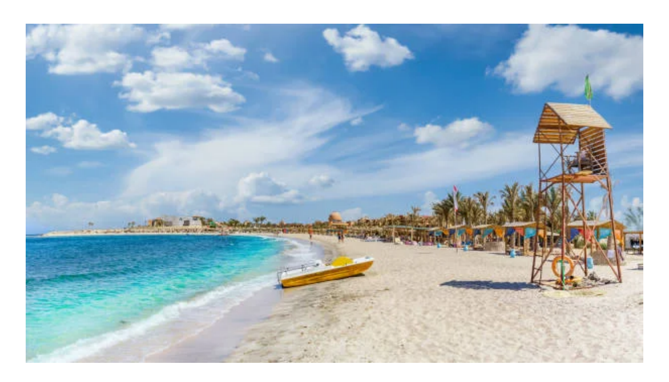
Tag 5: Marsa Alam

then on to Marsa Alam to spend some lovely relaxing time by the Sea Mediterranean.. When the skies are clear, you can enjoy many activities, including water skiing, diving, dolphin watching and more When you return to Cairo,