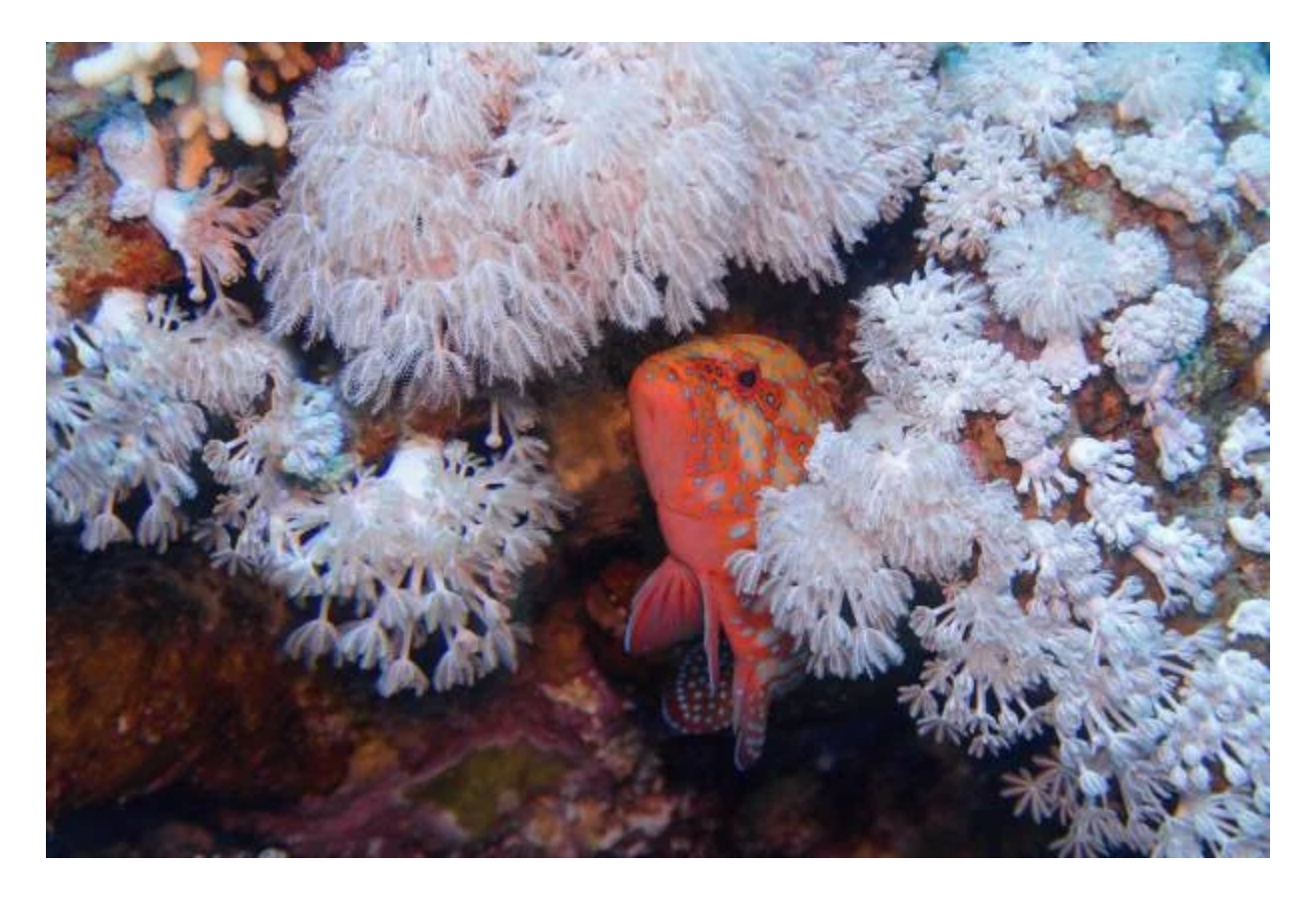
Tag 5: Sharm El-Sheikh

then on to Sharm El-Sheikh to spend some lovely relaxing time by the Sea Mediterranean.. When the skies are clear, you can enjoy many activities, including water skiing, diving, dolphin watching and more When you return to Cairo,