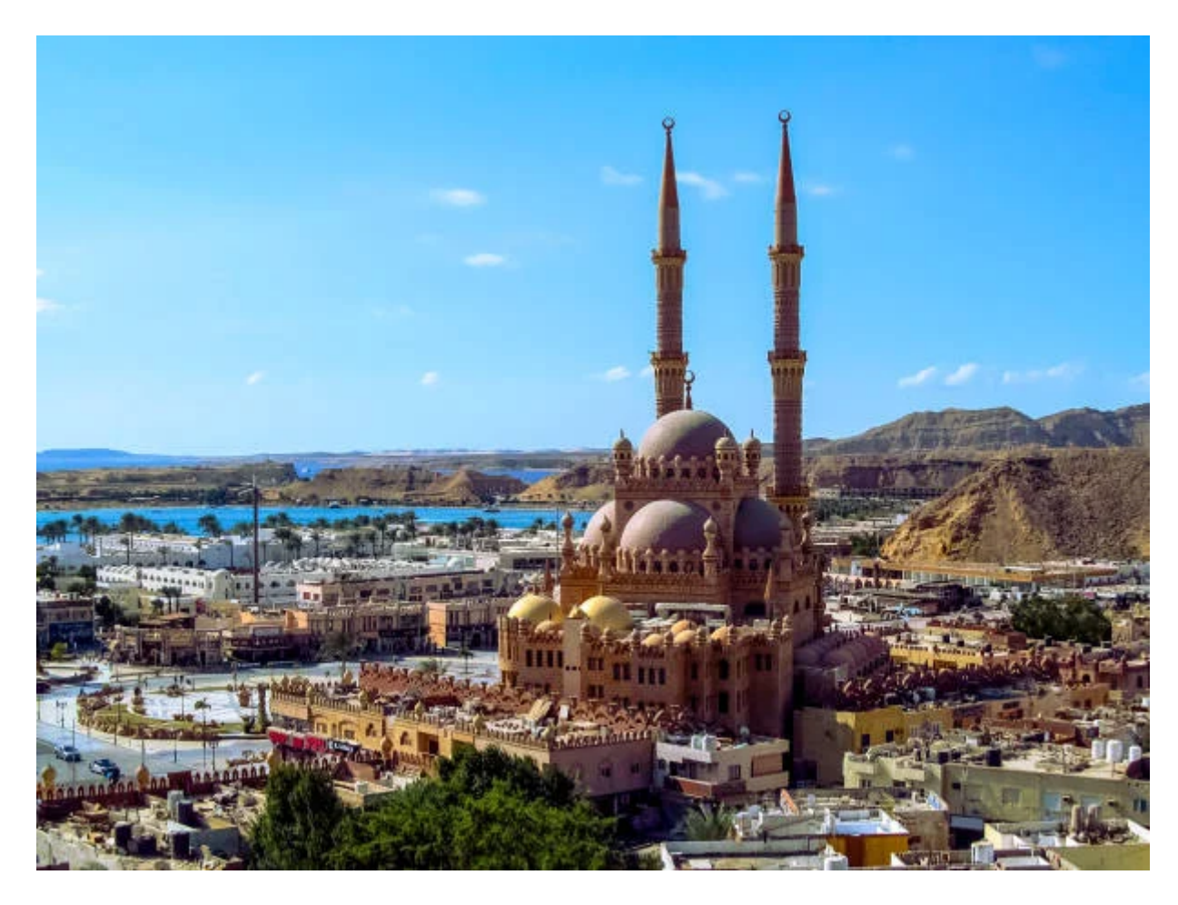
Tag 6: Sharm El-Sheikh