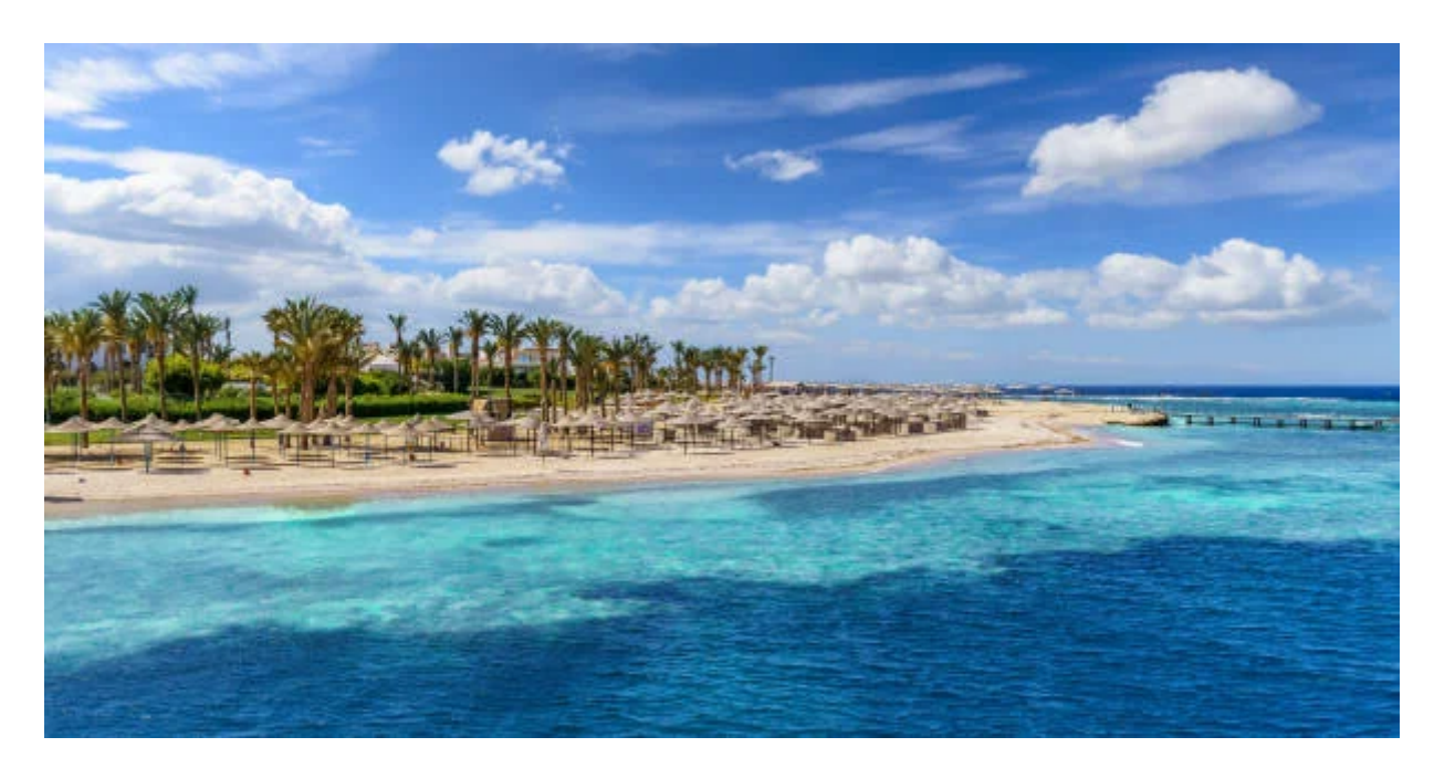
Tag 4: Fly to Hurghada

then on to Hurghada to spend some lovely relaxing time by the Sea Mediterranean.. When the skies are clear, you can enjoy many activities , including water skiing, diving, dolphin watching and more When you return to Cairo,