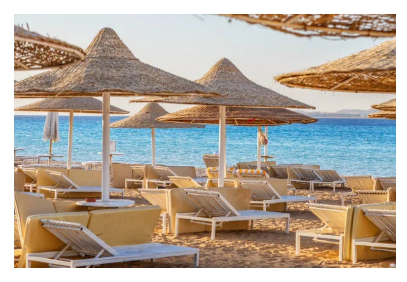
Tag 5: Hurghada

then on to Hurghada to spend some lovely relaxing time by the Sea Mediterranean.. When the skies are clear, you can enjoy many activities, including water skiing, diving, dolphin watching and more When you return to Cairo,