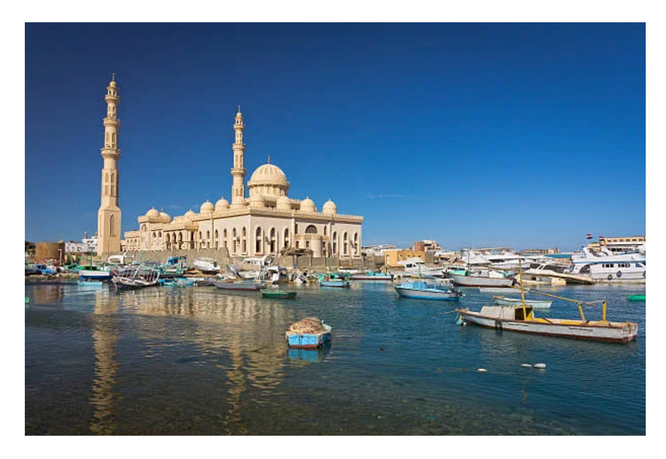
Tag 6: Hurghada

then on to Hurghada to spend some lovely relaxing time by the Sea Mediterranean.. When the skies are clear, you can enjoy many activities, including water skiing, diving, dolphin watching and more When you return to Cairo,