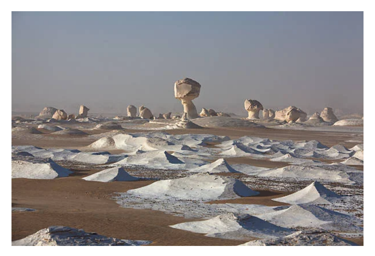
Tag 4: Cairo- White Desert

you will go on a four-hour trip into the white desert on After about 350 km, you will stop to have lunch and some refreshments, also known as the jewel of the desert, because it is a hill of crystal-like crystals where you can watch suitable exhilarating when the light hits it, then it