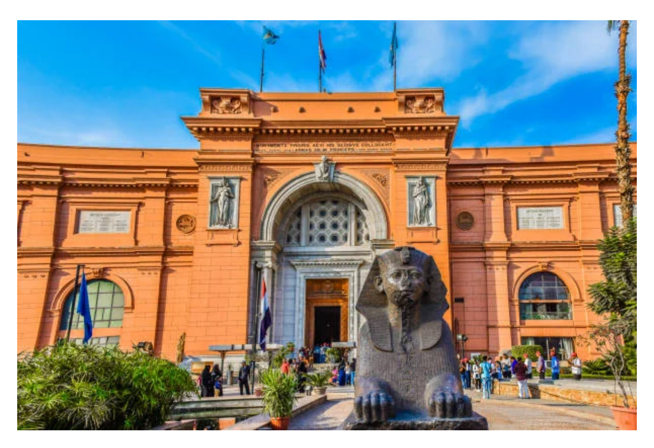
Tag 3: Egyptian Museum, Old Cairo

When you arrive at Cairo airport, you will meet our representative, Sera, who is air-conditioned, and go to your hotel and spend the night fun and quiet. The next day, you will go to the area of the pyramids of Giza and see the pyramids, the three, and the Sphinx , and then visit the pyramids of Saqqara , some after, and then we will take you to our representative for lunch, then return to your hotel to relax. The morning of the next day, after eating breakfast, we will take you to our delegates to visit the Egyptian Museum and Religions, the Hanging Church , and the Jewish Museum , Coptic, and then take a break to eat lunch on the fourth day of your trip. After breakfast, you will go on a four-hour trip into the white desert on After about 350 km, you will stop to have lunch and some refreshments, also known as the jewel of the desert, because it is a hill of crystal-like crystals where you can watch suitable exhilarating when the light hits it, then it will be used in horses in the desert and dinner in the camp, but enjoy watching the stars, and the next day you can enjoy a full day in health. White will use the location