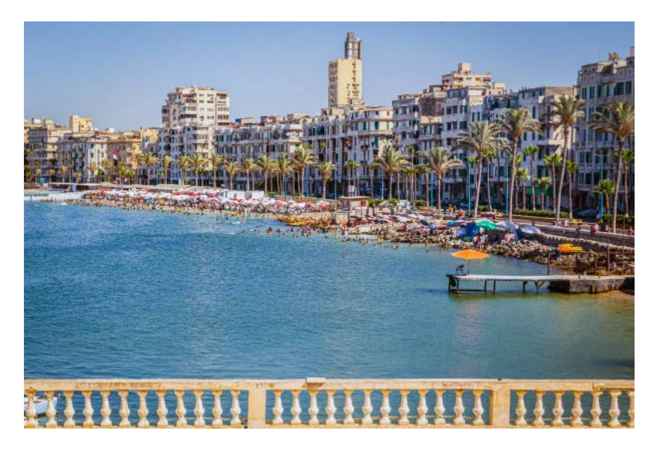
Tag 3: Overday Alexandria

the next day you will go to Alexandria we will take you to the Citadel of Qaitbay and then to Kom el-shukafa and the Pompey's Pillar that was built of granite stone,