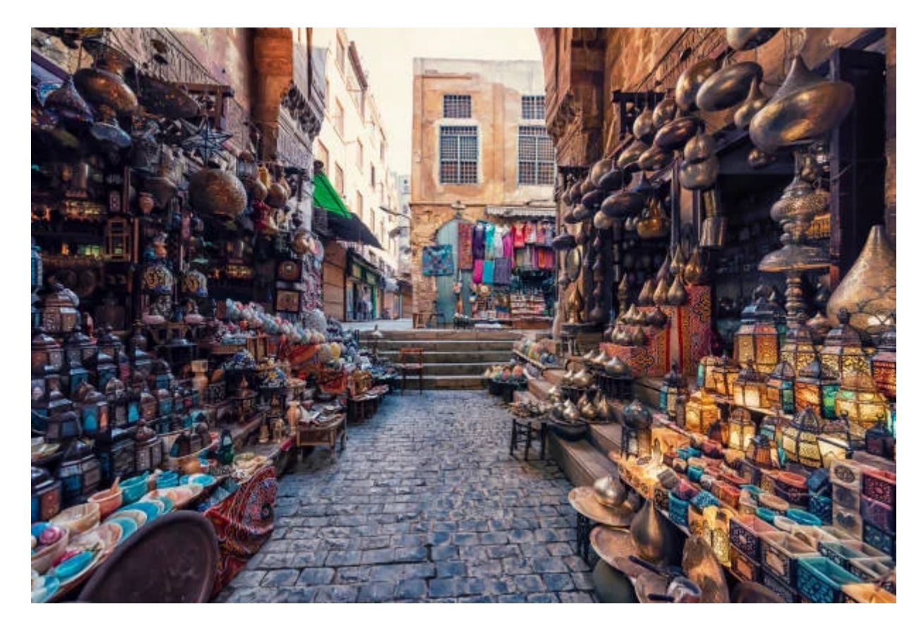
Tag 6: Khan el-Khalili & Salah El-Din Citadel

the next day you will go to Alexandria we will take you to the Citadel of Qaitbay and then to Kom el-shukafa and the Pompey's Pillar that was built of granite stone,