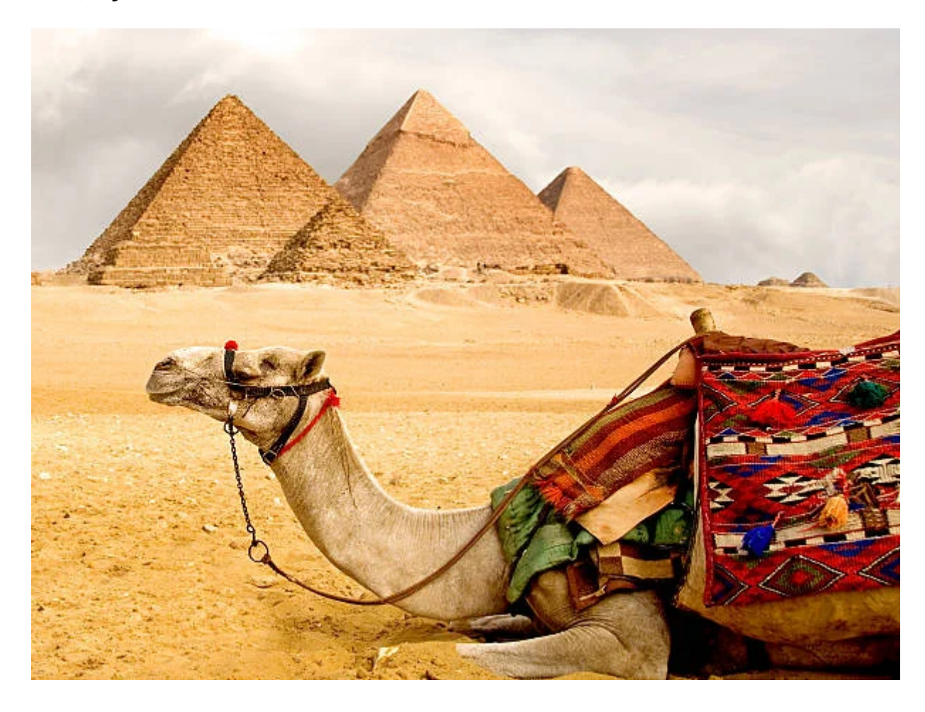
Tag 2: Memphis, Sakkara, Pyramids Tour

the next day you will go to Alexandria we will take you to the Citadel of Qaitbay and then to Kom el-shukafa and the Pompey's Pillar that was built of granite stone ,