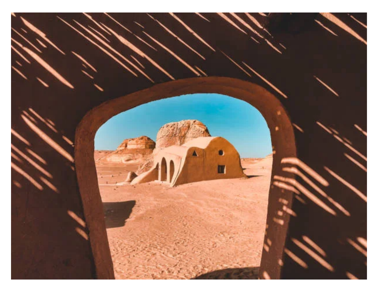
Tag 5: Overday Fayoum

the next day you will go to Alexandria we will take you to the Citadel of Qaitbay and then to Kom el-shukafa and the Pompey's Pillar that was built of granite stone,