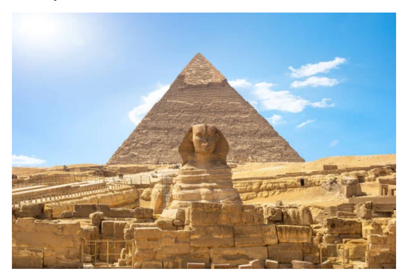
Tag 2: Memphis, Sakkara, Pyramids Tour

the next day you will go to Alexandria we will take you to the Citadel of Qaitbay and then to Kom el-shukafa and the Pompey's Pillar that was built of granite stone,