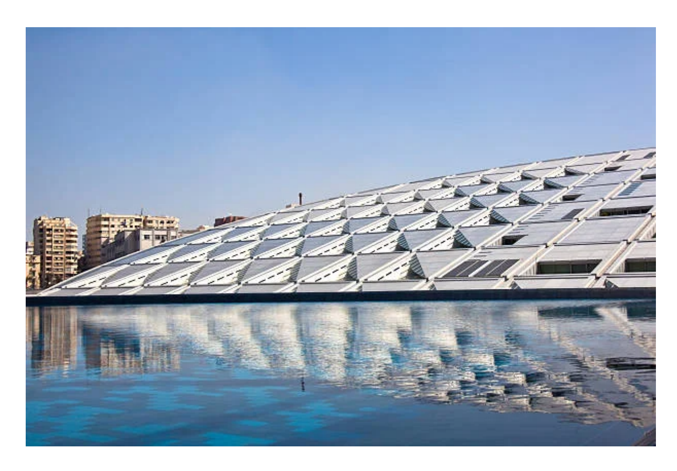
Tag 3: Alexandria

the next day you will go to Alexandria we will take you to the Citadel of Qaitbay and then to Kom el-shukafa and the Pompey's Pillar that was built of granite stone ,