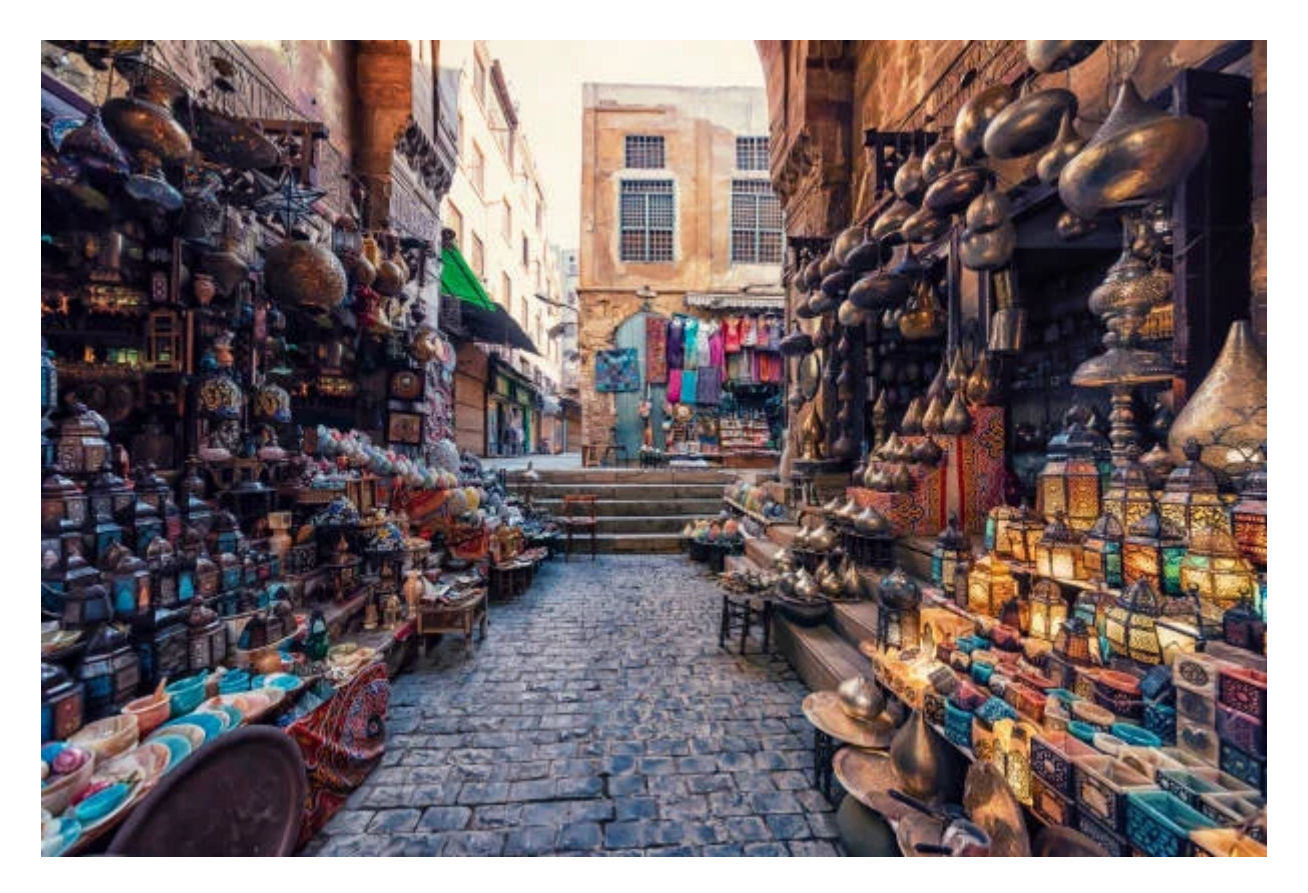
Tag 6: khan El-Khalili & Salah El Din Citadel

the next day you will go to Alexandria we will take you to the Citadel of Qaitbay and then to Kom el-shukafa and the Pompey's Pillar that was built of granite stone,