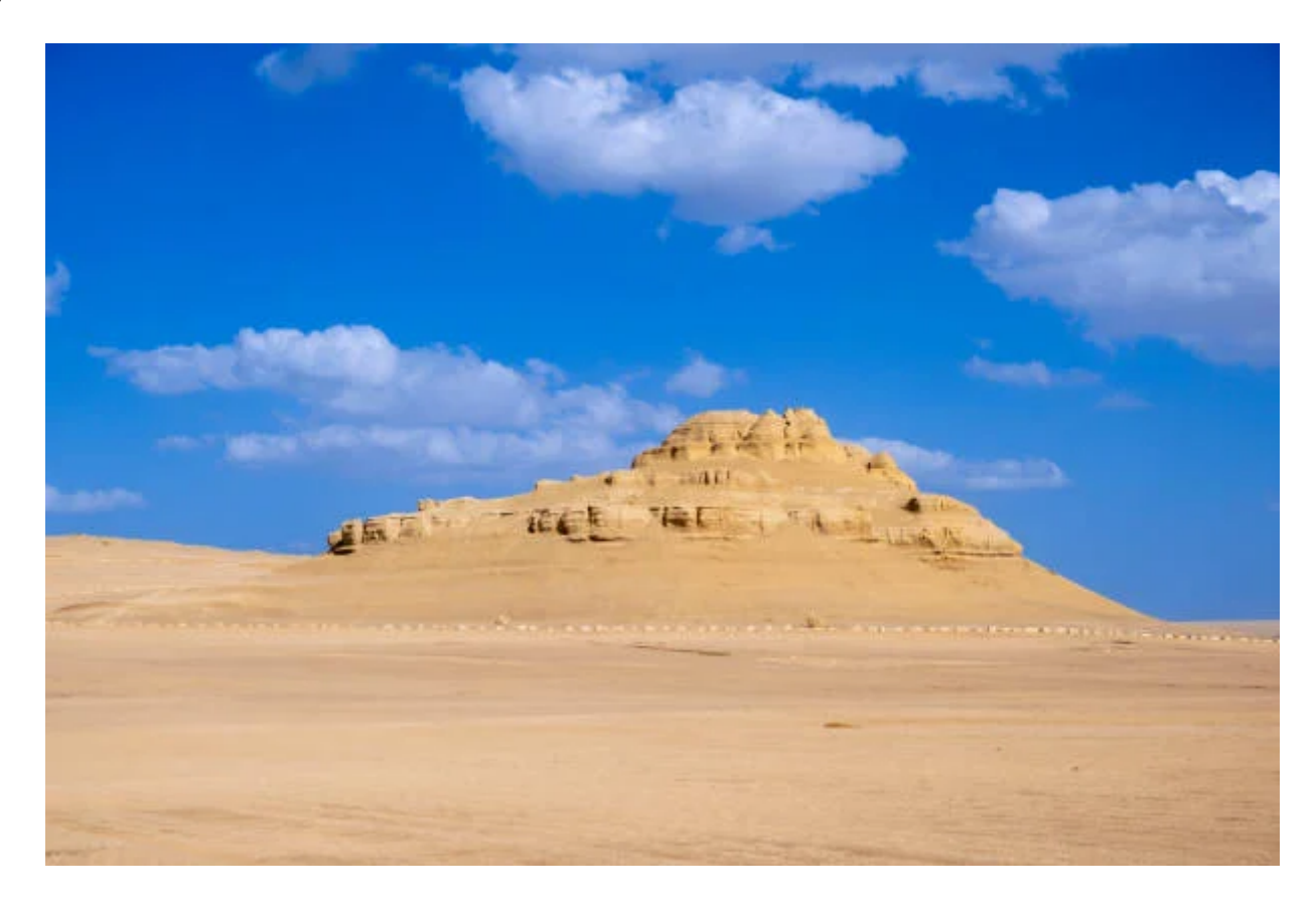
Tag 5: Overday Fayoum

the next day you will go to Alexandria we will take you to the Citadel of Qaitbay and then to Kom el-shukafa and the Pompey's Pillar that was built of granite stone ,