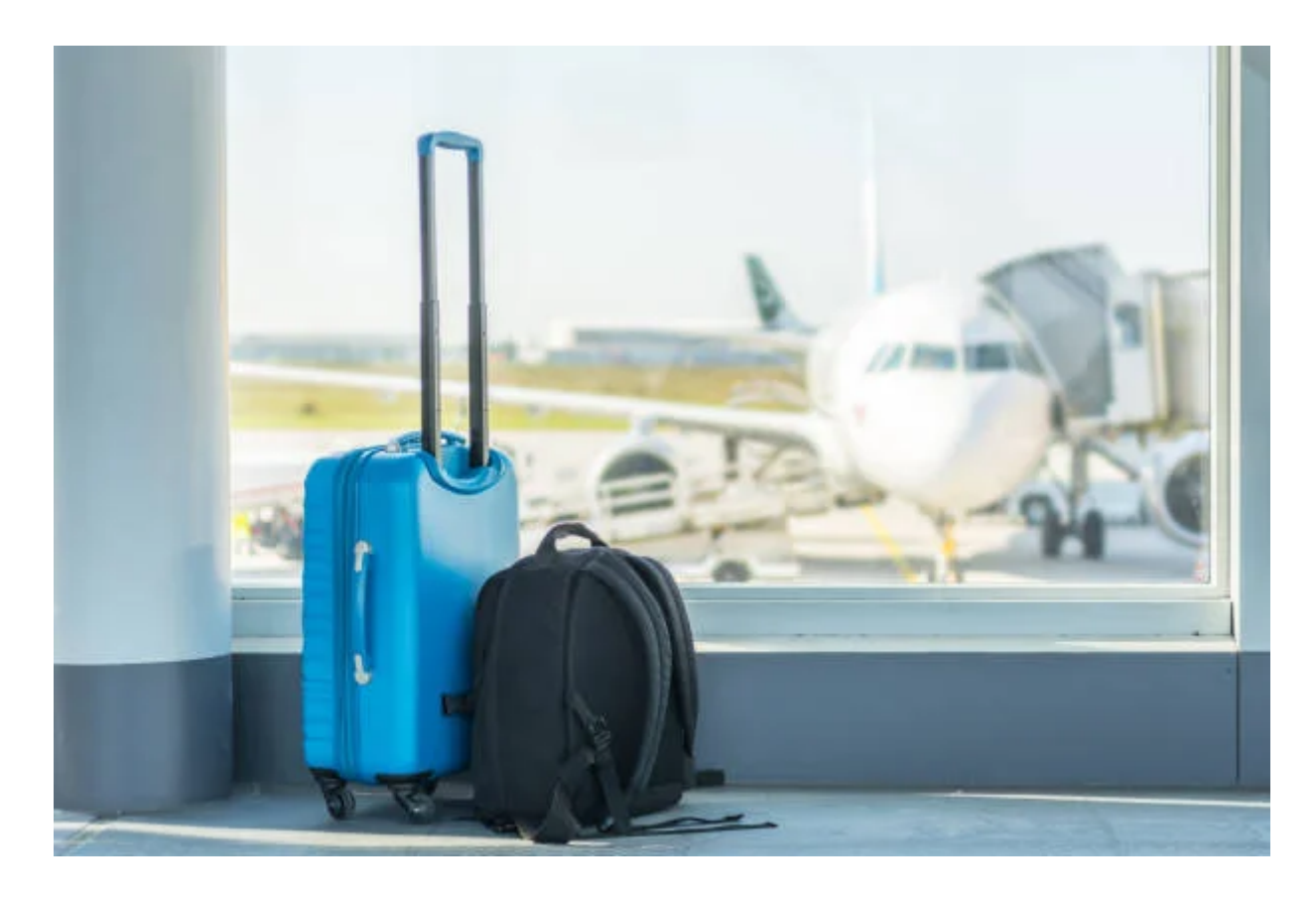
Tag 7: Departure

the next day you will go to Alexandria we will take you to the Citadel of Qaitbay and then to Kom el-shukafa and the Pompey's Pillar that was built of granite stone,