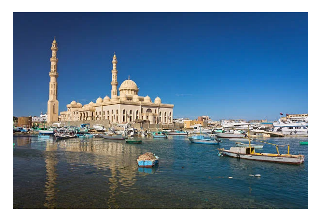
Tag 8: Hurghada