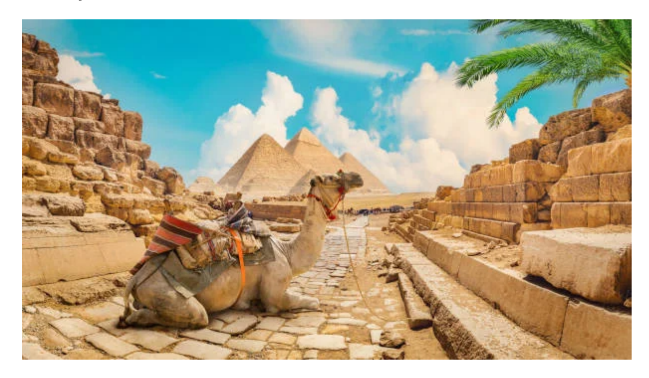
Tag 2: Memphis, Sakkara, Pyramids Tour